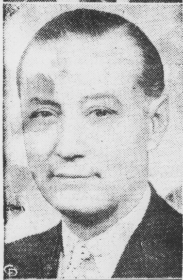
Harry Hopkins Governor Davey

Federal Relief Administrator Harry L. Hopkins has bluntly refused to take over Ohio's relief problem. In a blistering letter to Gov. Martin L. Davey, Hopkins said he expected Ohio to continue to furnish $2,000,000 a month toward its own relief expenses.