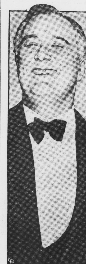
President Roosevelt This excellent photograph of President Roosevelt, made during a recent social gathering, portrays that happy smile still adorning the chief executive's features after two years in office.