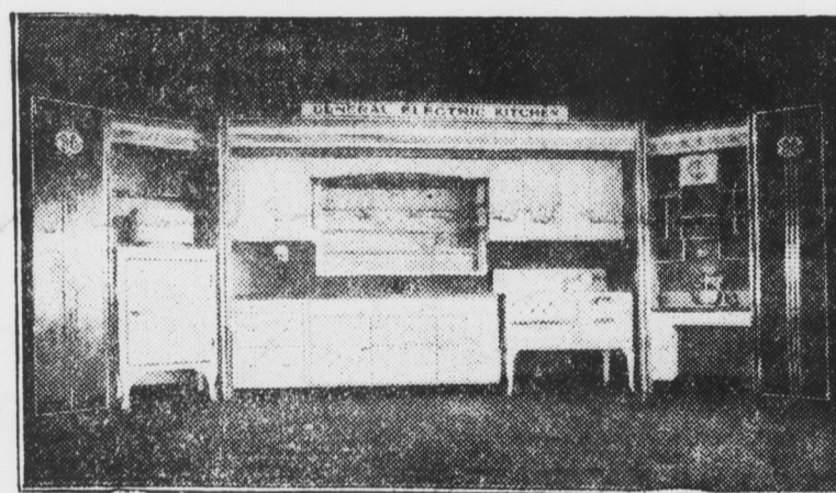
The GE All Electric Kitchen

Three Days Wednesday Thursday Friday From 10 A. M. Until Noon