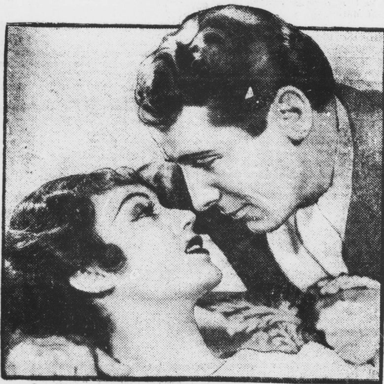
Fay Wray and Victor Jory in "Mills of the Gods" A Columbia Picture.

It's love at first sight for Fay Wray, as the pampered darling of society, and Victor Jory, fiery labor leader, in Columbia's "Mills of the Gods", which opens Wednesday at the Stevenson Theatre. And its romance as fascinating as the turbulent background which serves as a setting for this dramatic film. May Robson is starred.