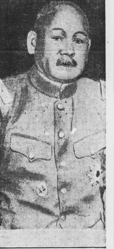
New photo of Gen. Kiro Minami, Japanese commander in Manchukuo, who pulls the strings of the puppet state. He is reported to be preparing to carve another rich province from China, including the old capital at Peiping, and seeking to oust Chiang Kai-shek as generalissimo of the Chinese.