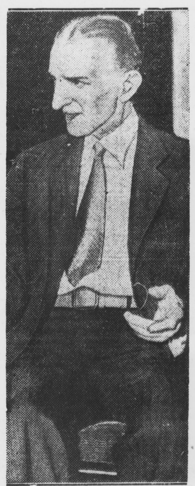
"The greatest achievement of my life," said Nikola Tesla on his 79th birthday, pictured in New York when speaking of his latest discov- ery, a method of sending mechanical impulses to all parts of globe as guide for ships and as indicators of world's mineral wealth. Impulses can also be used in time of war to explode bombs anywhere.