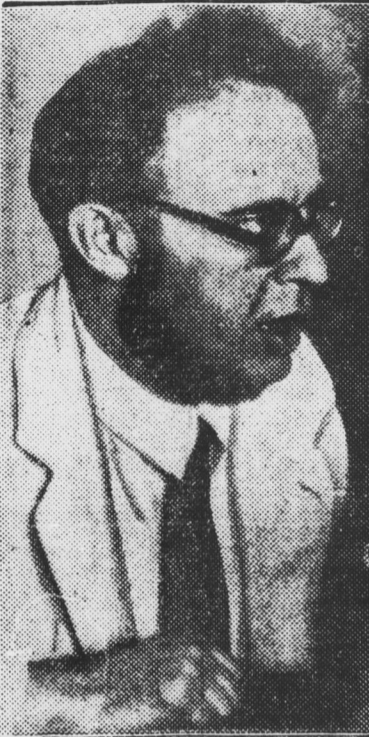
Karl Radek, Soviet editor whose declarations reflect official views, is telling readers of Russian press that a dictatorship of middle class origin will be set up in U. S. within a short time.