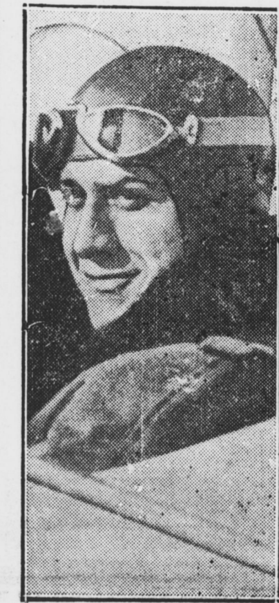
Mussolini's son-in-law, Count Galeazzo Ciano, led the Italian squadron which conducted the first bombing raids in Ethiopian territory.