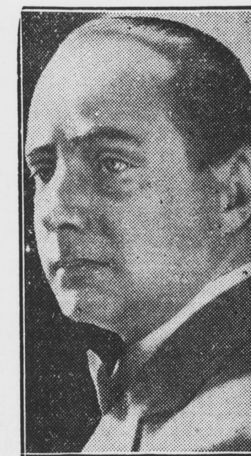
Achille Starace, secretary of the Fascist Party in Italy, will probably fly to Eritrea to carry Il Duce's message of encouragement to Italy's East African legions.