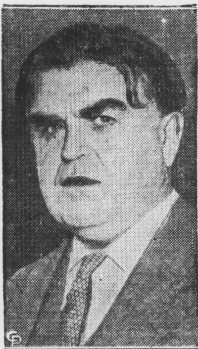
John L. Lewis

Does the resignation of John L. Lewis, above, as vice president of the American Federation of Labor, indicate a sharp battle of progressives vs. conservatives? Lewis, president of the powerful United Mine Workers of America, leads the fight of labor progressives for organization of entire industries instead of by crafts. Lewis is believed to have a majority of organized labor in the big key industries behind him.