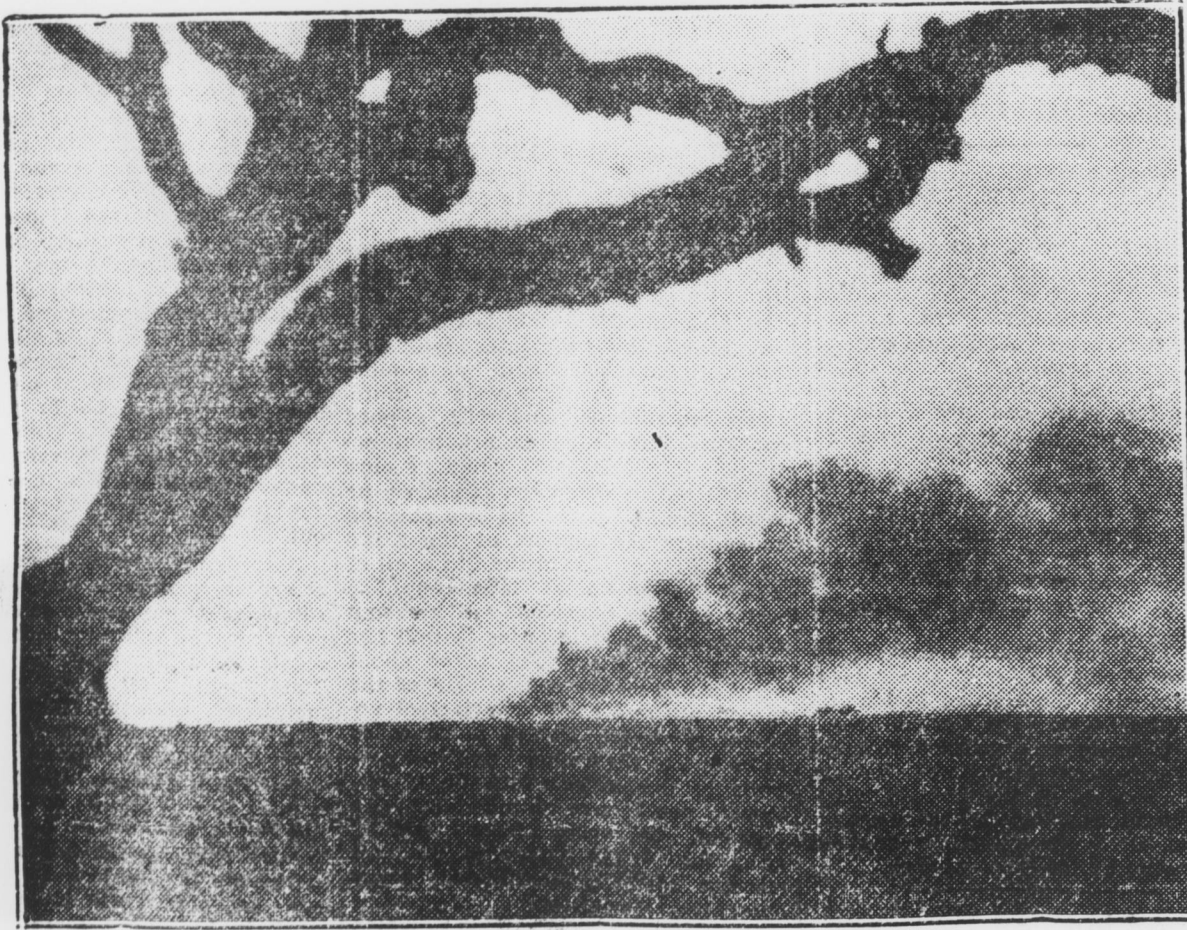
Striking photograph of Mauna Loa, Hawaiian volcano which recently became active for first time in five years, shows it in eruption as streams of lava poured down the peak and threatened for a time to wipe out Hilo, city of 25,000.