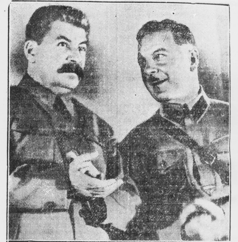
After having been Russia's man of mystery for years since he became its absolute dictator, Joseph Stalin (left) is being given a build-up as a "human" by his regime, with Russian newspapers running sentimental stories about his mother and plenty of new photos such as this, showing him in a moment of relaxation with K. E. Voroshilov, Soviet minister of war. He's even kissing babies for the photographers and joining tribes as honorary chief.