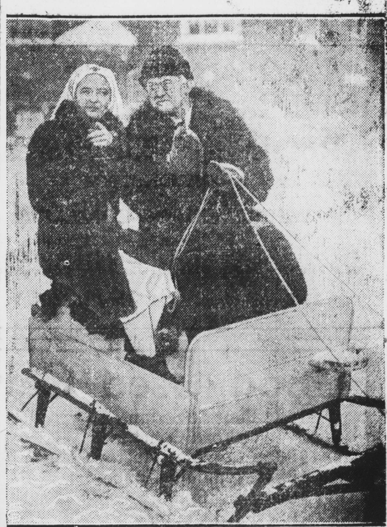
Dorothy Peterson and Jean Hersholt at quintuplets' home. Jean Hersholt and Dorothy Peterson, Hollywood character players, are shown at Callender, Ontario, dressed in the costumes they will wear in the forthcoming first full-length movie of the Dionne quintuplets. Hersholt plays the part of Dr. Allan Roy Dufosse and Peterson the part of the chief nurse.