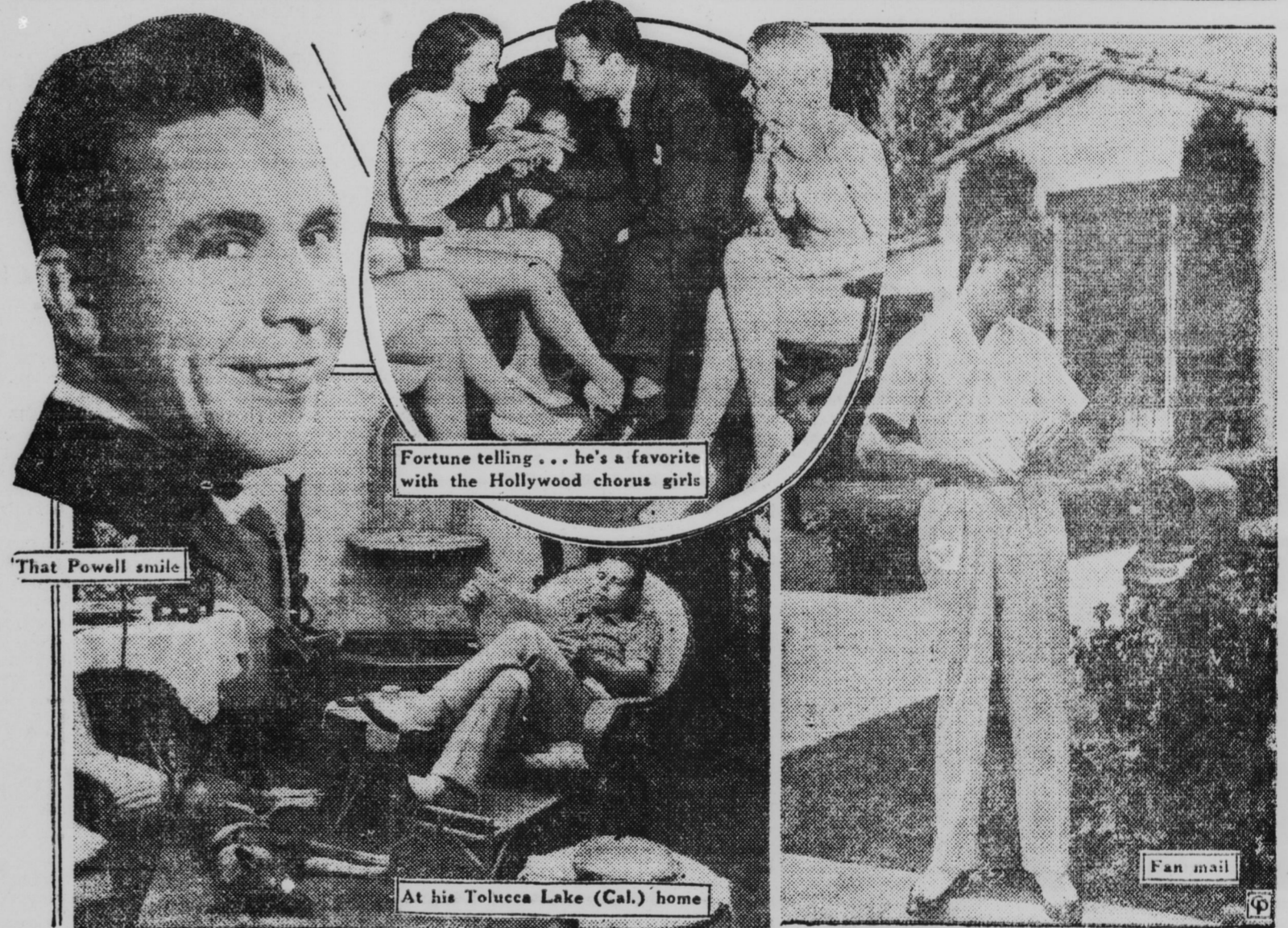
That Powell smile