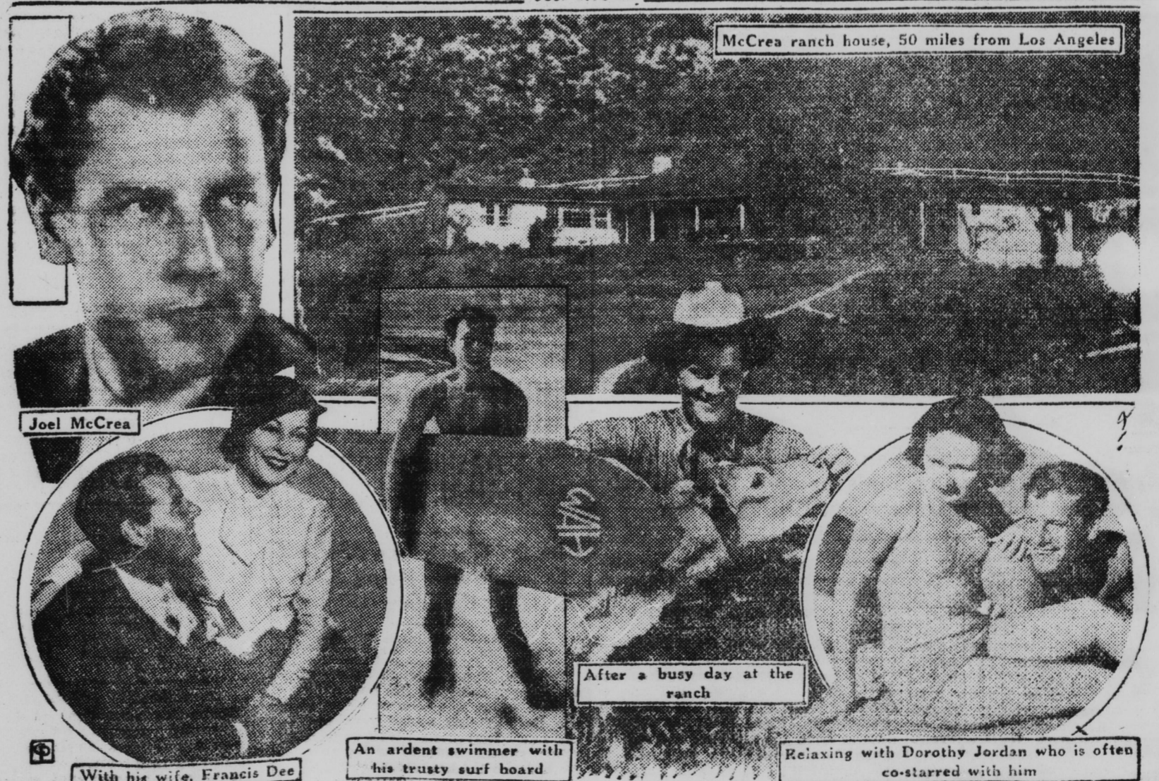
McCrea ranch house, 50 miles from Los Angeles