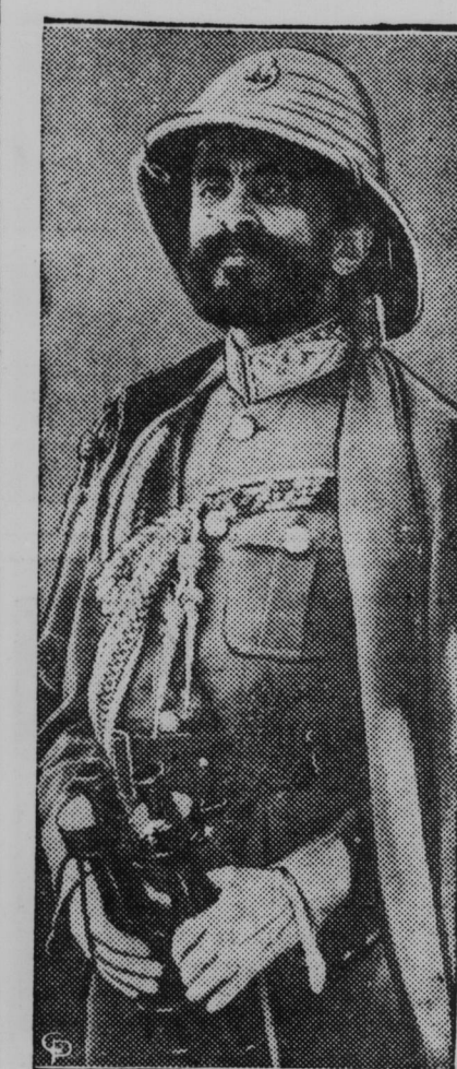
HAILE SELASSIE, Fugitive emperor of Ethiopia