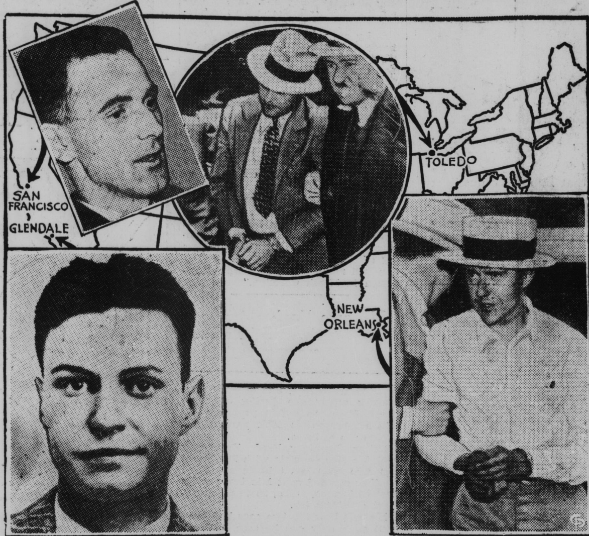
Map of U. S. shows where G-men seized Public Enemies