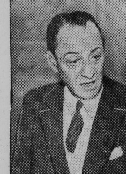
Jesse I. Strauss, left, United States ambassador to France, is pictured at the luncheon of the American press in Paris with Leon Blum, the French Socialist leader and next premier of France.