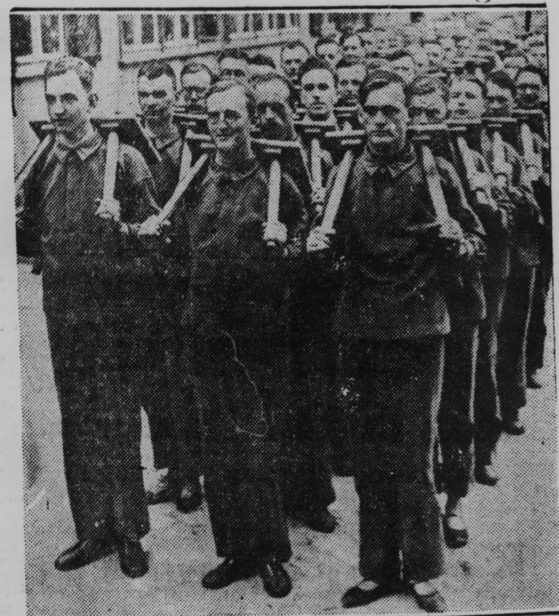
Two months of physical exercise and other training are required of all students in Germany. This picture, taken at the Jueterbog barracks near Berlin, shows law students lined up, with their stools held over their shoulders like yokes. (Central Press)