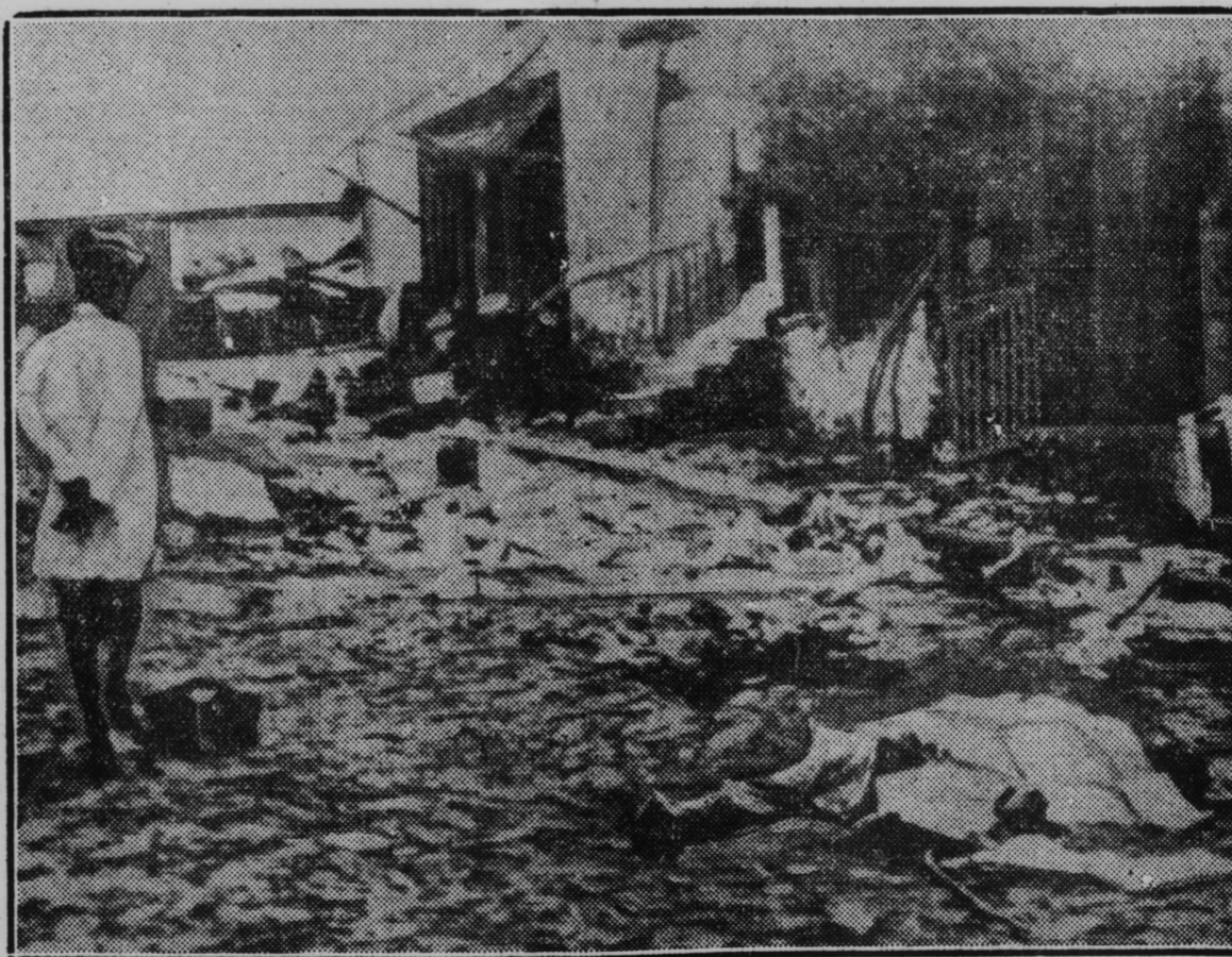
This picture, flown to Rome from Addis Ababa, then telephoned from Rome to London, carried by plane to Friedrichshafen and brought to America on the second flight of the Zeppelin Hindenburg shows a typical scene that met the victorious Italian troops as they entered Addis Ababa. Debris-littered streets, sacked and razed buildings and scattered bodies of slain defenders marked the conquered town.