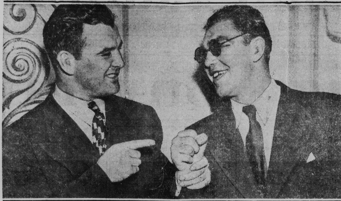
Champion James J. Braddock (left) who always said a good right could beat the heavy Bomber, jimmies the formidable fist that laid Joe Louis low. Look at the shanty on Max Schmeling's eye! Max and Jimmie will battle it out in the Fall.