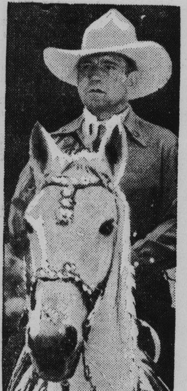
BUCK JONES in "SILVER SPURS" A UNIVERSAL PICTURE At The Vance Theatre Friday and Saturday