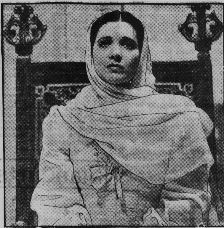
Kay Frances in "The White Angel"