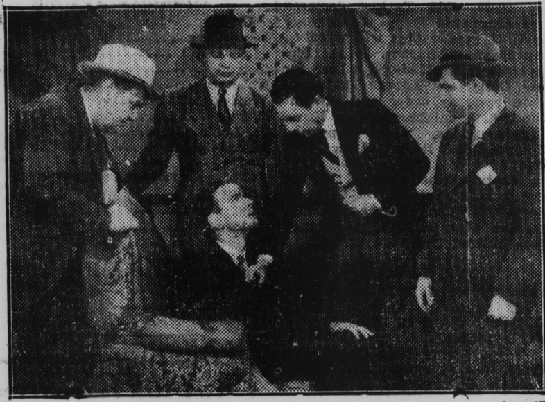
At The Vance Theatre Wednesday, Thursday Scene from "Easy Money"

will look even more exotic than the variety of materials they contain would seem to warrant.