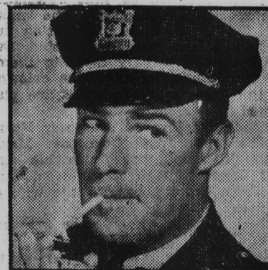
Stevenson Theatre Saturday—Randolph Scott in "And Sudden Death"

This firm has some news on dresses that would knock the average feminine buyer into ecstasies and orgies of buying. It also gets in a little two-cent piece of its own that a bit of advice on how to clean these dazzling garments if you drop part of a bacardi or gin fizz on one. It is also remodeling part of its plant and hiring several experts who will do all the work on gowns such as these when they are sent to the cleaners.