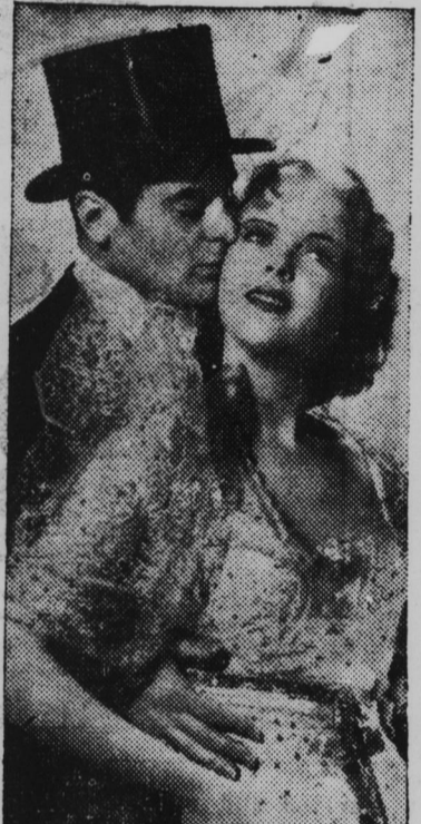
Francis Lederer and Ida Lupino in "One Rainy Afternoon." At The Vance Theatre Monday and Tuesday

The East and the Far East beats us in production costs through the combination of automatic machinery and starvation wages.