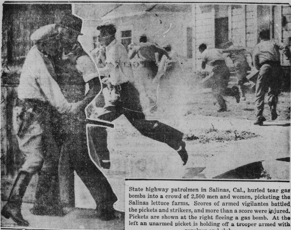
State highway patrolmen in Salinas, Cal., hurled tear gas bombs into a crowd of 2,500 men and women, picketing the Salinas lettuce farms. Scores of armed vigilantes battled the pickets and strikers, and more than a score were injured. Pickets are shown at the right fleeing a gas bomb. At the left an unarmed picket is holding off a trooper armed with revolver and club.