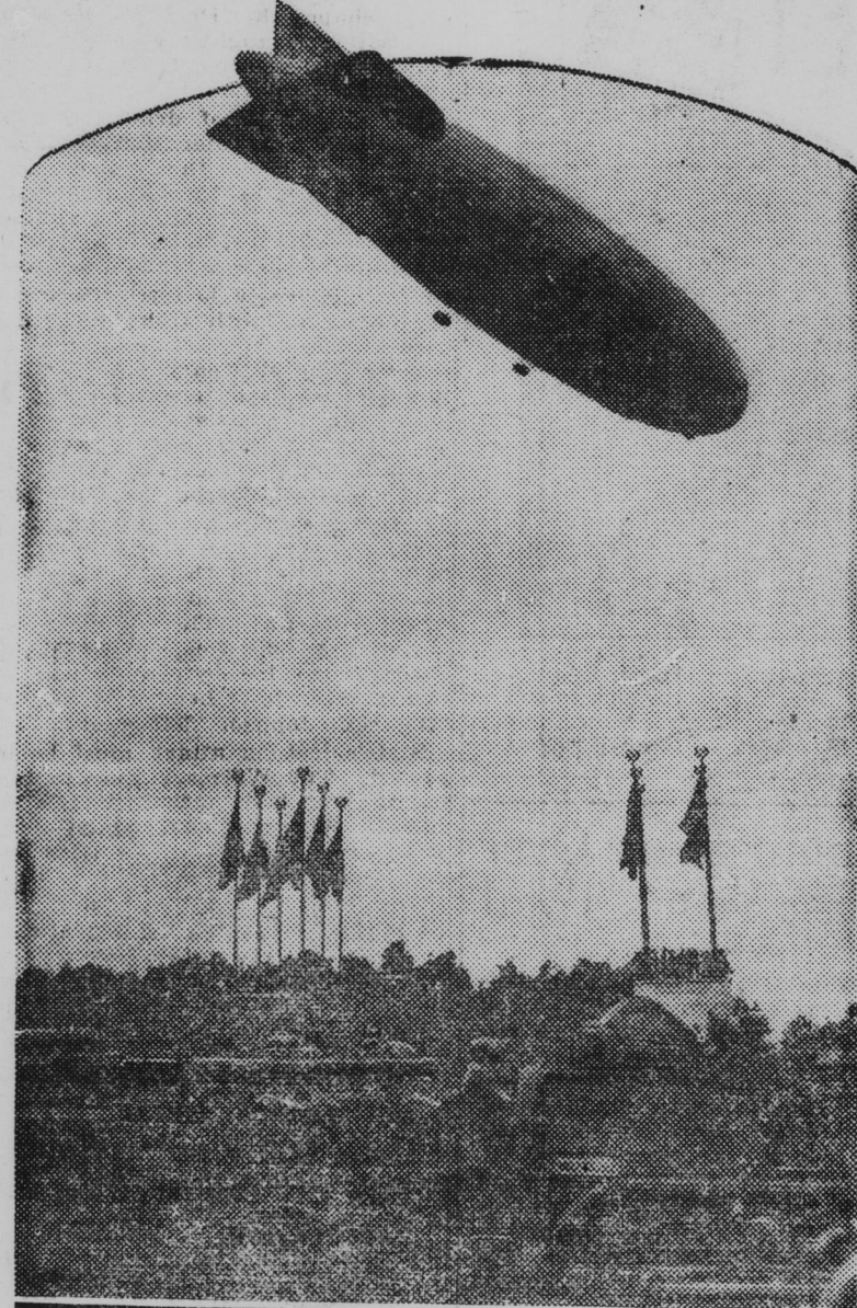
While the huge Zeppelin Hindenburg roared overhead, scores of motorized artillery units and hundreds of fast, armed tanks rumbled by the stand at the Nuremberg Nazi party congress, where Adolf Hitler, with arm outstretched in Nazi salute, reviewed them.