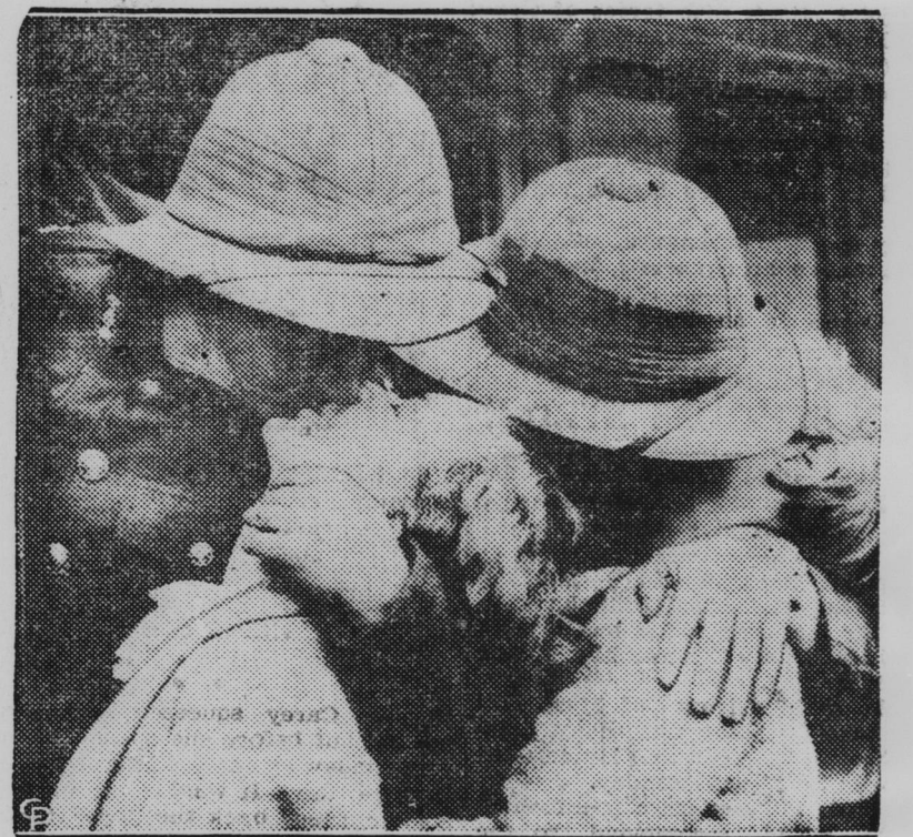
Royal Irish Fusiliers privates being kissed goodby