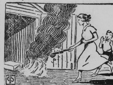
Use dirt to extinguish gasoline or oil fires. Water does no good.