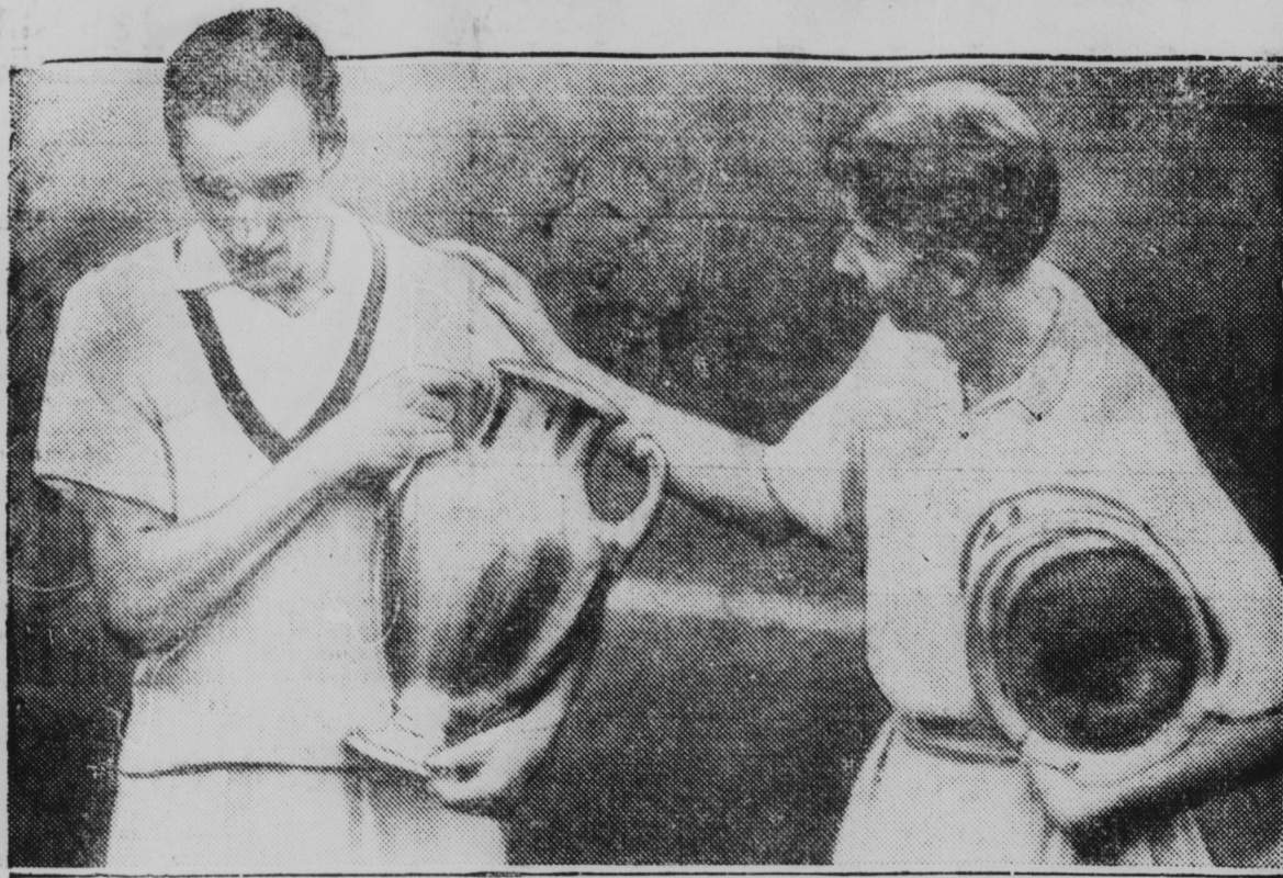
Fred Perry (left) of England proved himself too much for Donald Budge (right), American star, in five terrific sets at Forest Hills, L. I. This was the third singles championship for Perry and he now takes permanent possession of the cup which he is holding.