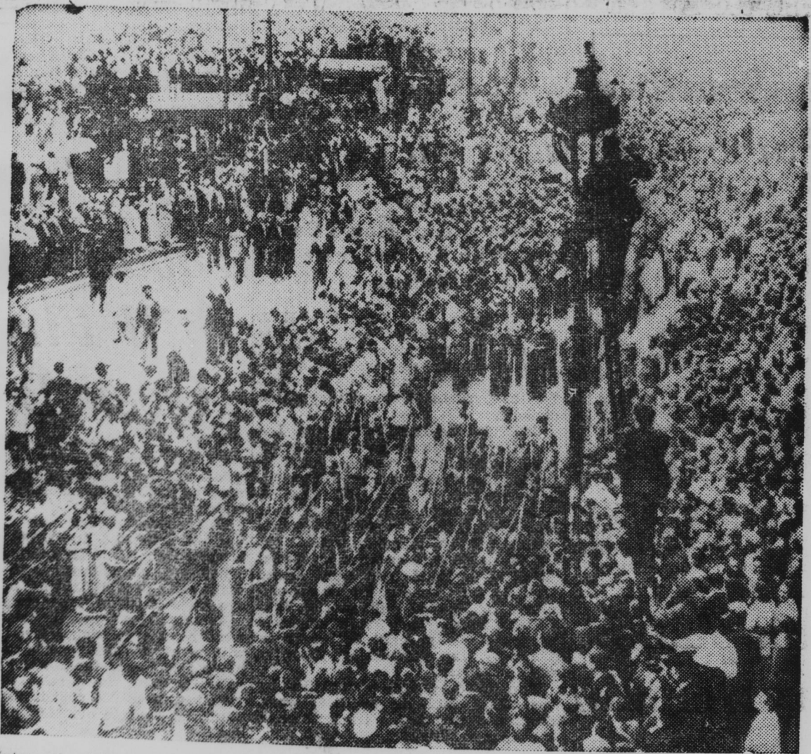
International Youth Day was celebrated in beleaguered Madrid, but the festival, once a gay affair took on a grim significance. Here is pictured the parade marching on the Puerta del Sol, Madrid's great square. Those rifles were carried by boys and girls, many of whom left for the front immediately after the parade.