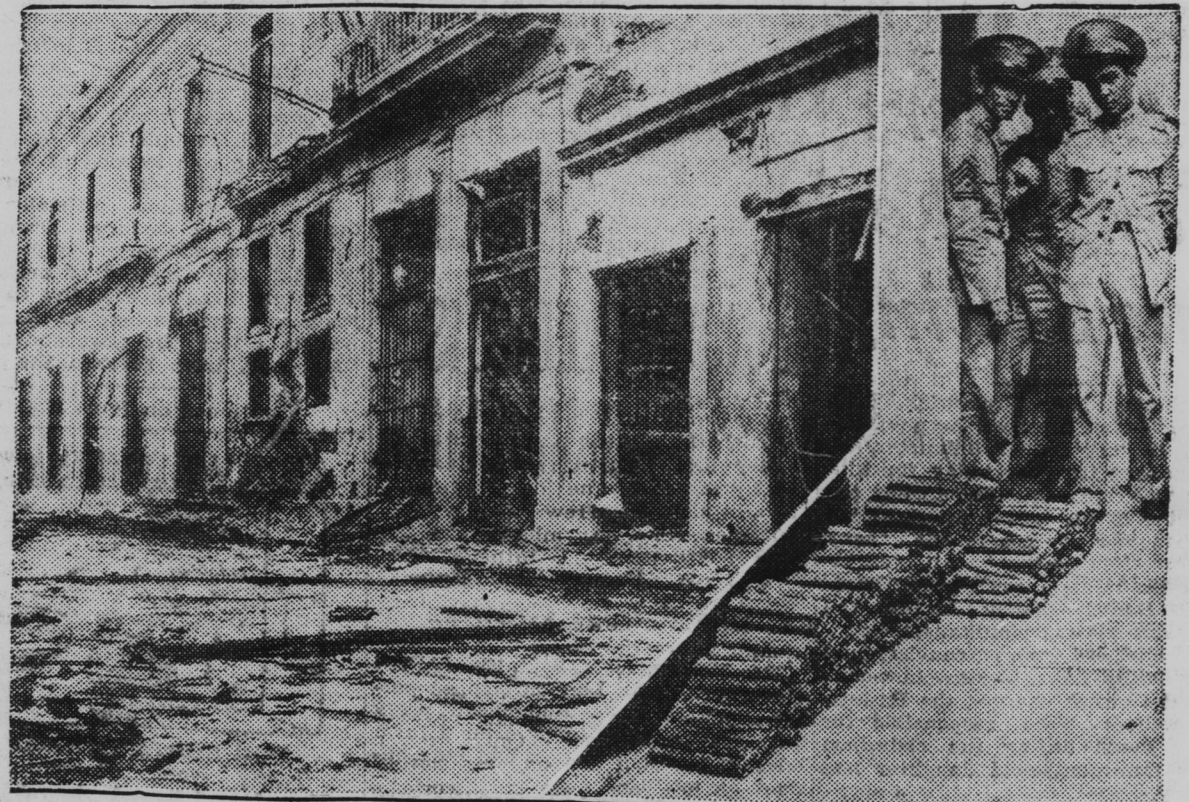
At the left is the wrecked plant of the Havana newspaper El Pais following the explosion of a small truck loaded with 1500 pounds of dynamite. At the right is shown some of the 1500 pounds of dynamite found in a small car outside the plant of another Havana newspaper, El Diario de la Marina, where alert police prevented its explosion. Four were killed in the Pais blast.