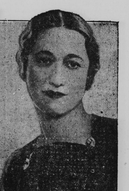
Mrs. Ernest Simpson

A divorce was granted in the Ipswich, England, assizes court today to Mrs. Ernest Simpson, Baltimore-born intimate friend of King Edward VIII of Great Britain. The decree will be made absolute in six months, after which time Mrs. Simpson will be free to marry the king, as many think she will do. King Edward is shown in the picture upper left and Mrs. Simpson to the right.