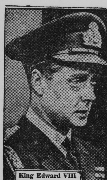
King Edward VIII