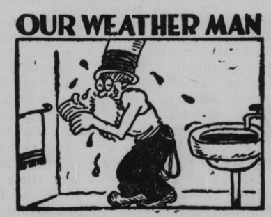
OUR WEATHER MAN FOR NORTH CAROLINA. Cloudy, rain tonight and probably in east portion Thursday morning; colder.

A bulletin issued by the war ministry stated that government militia had carried out "an encircling move-