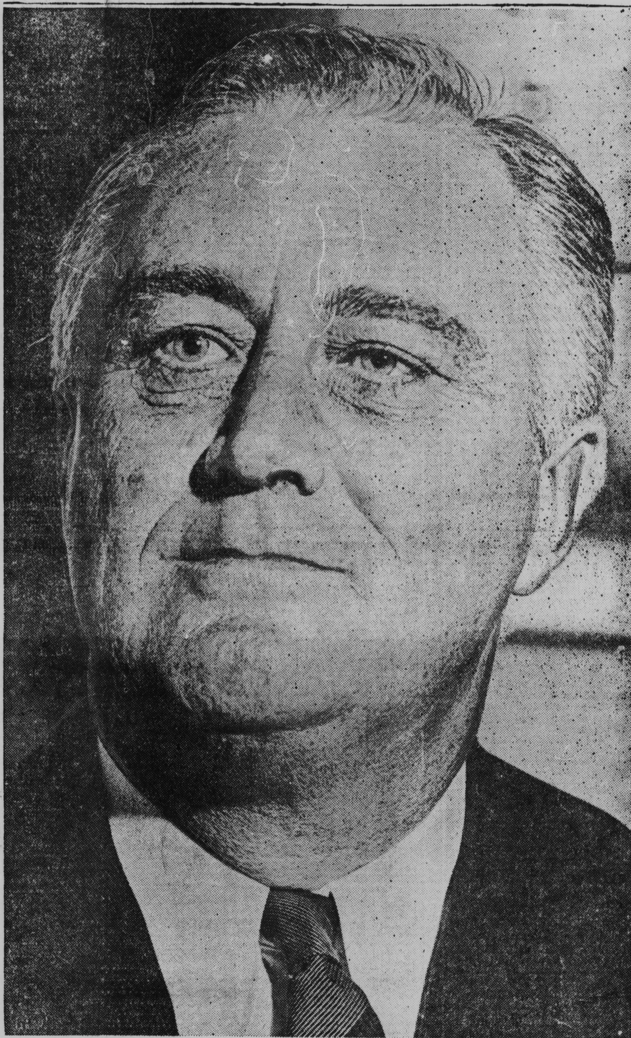
Franklin D. Roosevelt