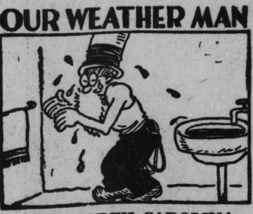
OUR WEATHER MAN FOR NORTH CAROLINA. Cloudy and threatening tonight and Sunday; not much change in temperature.