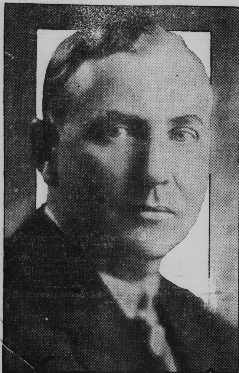
GOVERNOR J. C. B. EHRLINGHAUS

"He Is In The Hands Of God," One Prelate At Vatican City Says In Statement