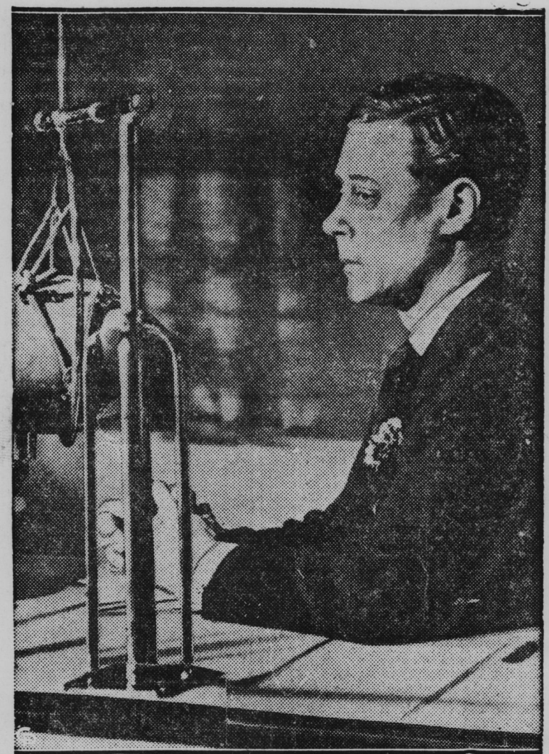
King Edward VIII speaking into microphone All England waited and wondered whether King Edward would talk to the people directly over the radio.