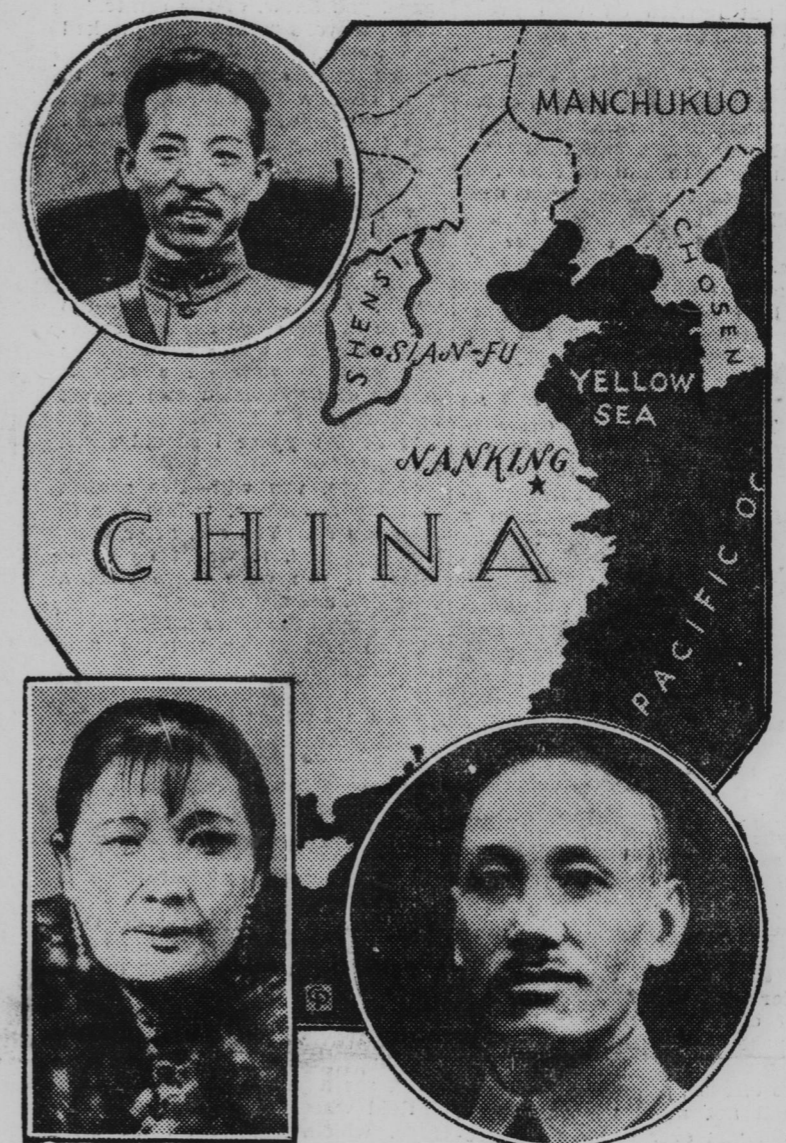
Scene of Chinese crisis; Marshal Chang, inset top; Generalissimo Chiang Kai-Shek and wife, inset below.

The entire Orient is tense over a possible revolution in China. Marshal Chang had demanded a declaration of war on Japan. Anti-Japanese feeling remains strong. The scene of the crisis is shown on the map above. Marshal Chang is pictured in top inset, while below are Generalissimo Chiang Kai-Shek and his wife, who had desired to go to Sianfu, to plead for his life—but who had been dissuaded by government authorities.