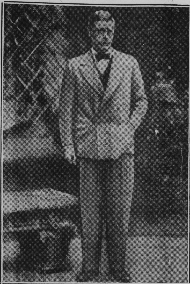
This picture, posed especially by the former King Edward VIII at Baron Eugene de Rothschild's Schloss Enzesfeld, near Vienna, was flashed by R. C. A. radio to New York. It is the latest picture of the monarch who renounced his throne for Wallis Simpson.