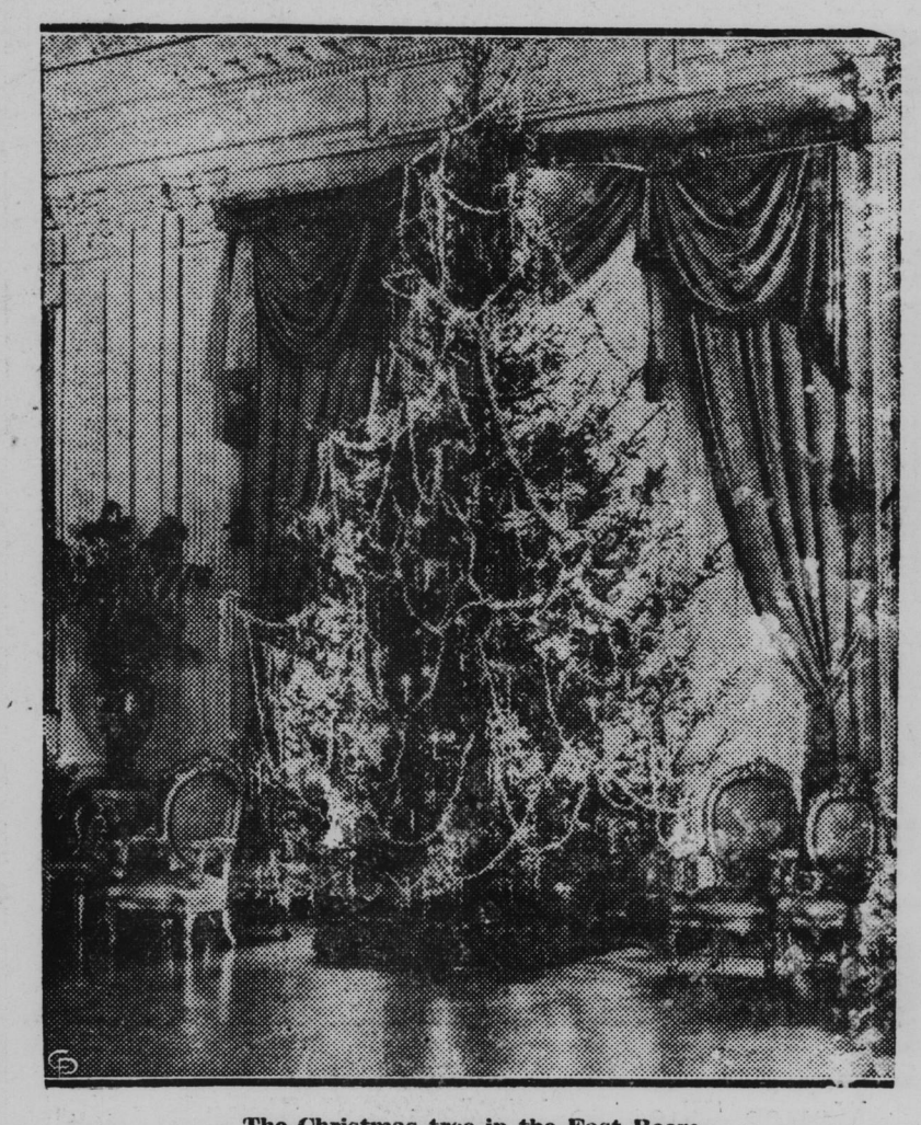
The Christmas tree in the East Room As in the past, the White House has a huge Christmas tree this year. And, as usual, it is in the East Room.