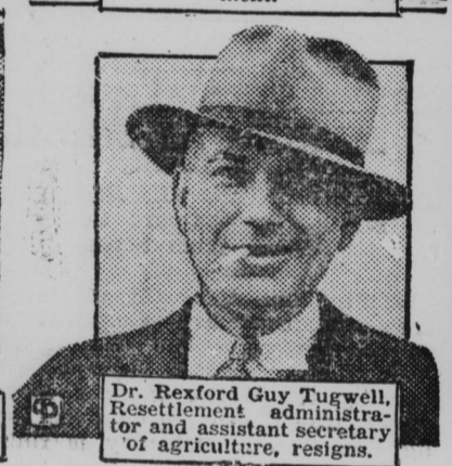
Dr. Rexford Guy Turwell, Resettlement administrator and assistant secretary of agriculture, resigns.