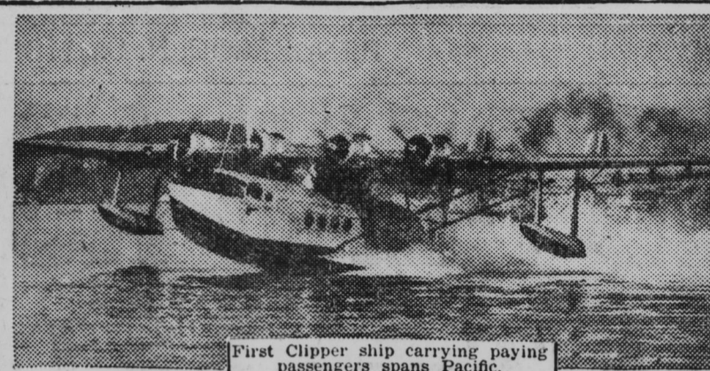
First Clipper ship carrying paying passengers spans Pacific.