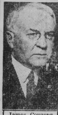
James Couzens, Michigan senator