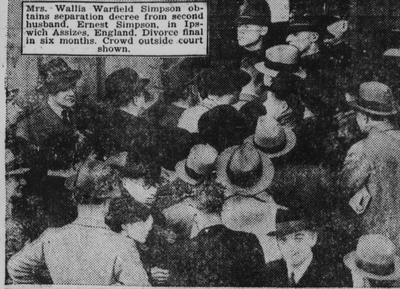
Mrs. Wallis Wardfield Simpson obtains separation decree from second husband, Ernest Simpson, in Ipswich Assizes, England. Divorce final in six months. Crowd outside court shown.