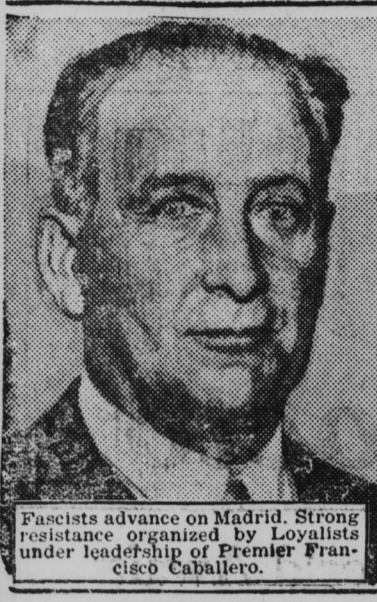
Fascists advance on Madrid. Strong resistance organized by Loyalists under leadership of Premier Francisco Caballero.