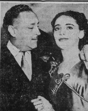
John Barrymore and Elaine Barrie climax stormy "Caliban and Ariel" romance by elopement to Yuma, Ariz.