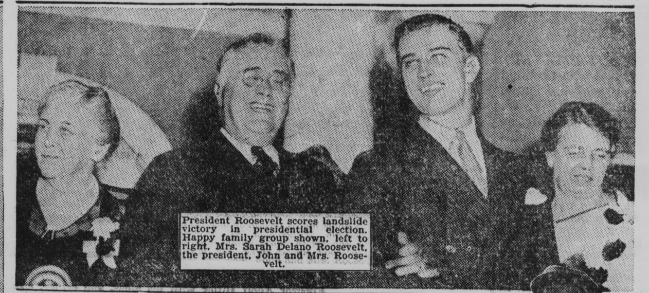
President Roosevelt scores landslide victory in presidential election. Happy family group shown, left to right, Mrs. Sarah Delano Roosevelt, the president, John and Mrs. Roosevelt.