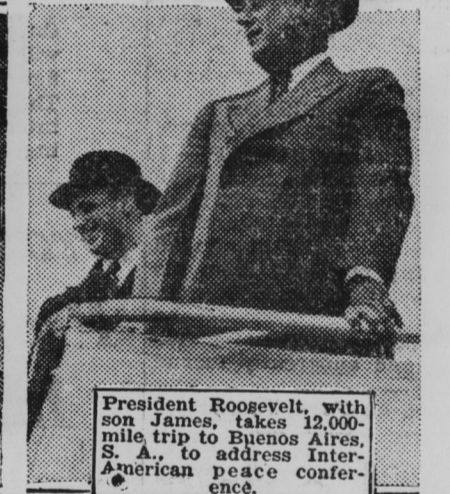
President Roosevelt, with son James, takes 12,000-mile trip to Buenos Aires, S. A., to address Inter-American peace conference.