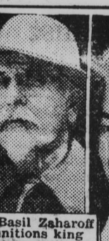
Sir Basil Zaharoff, Munitions king