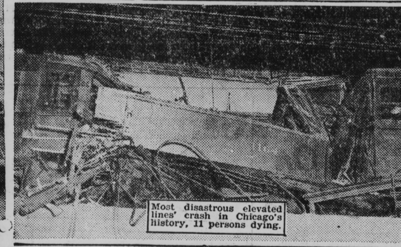
Most disastrous elevated lines' crash in Chicago's history, 11 persons dying.