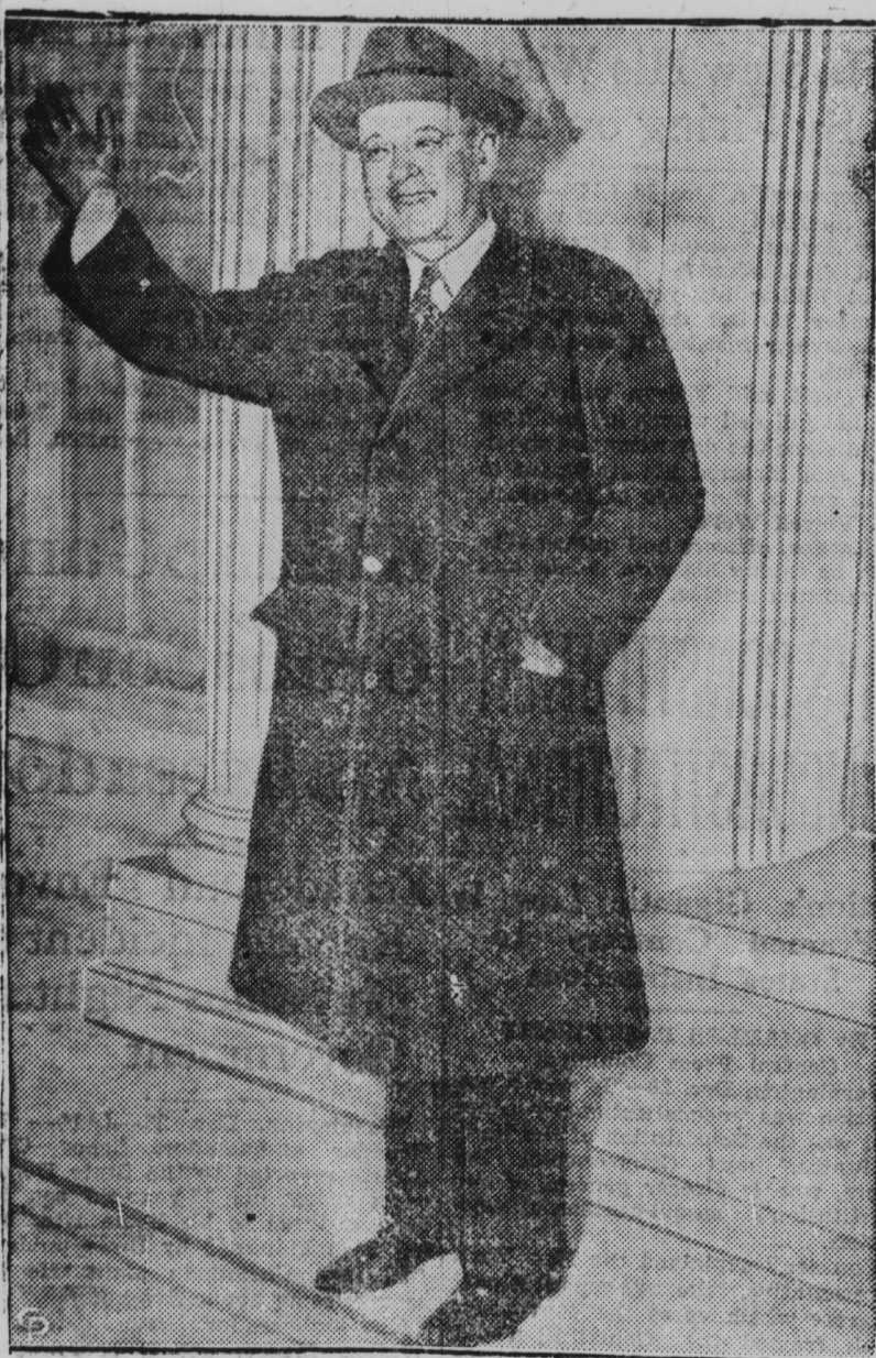
Gov. Alfred M. Landon at White House

Paying a courtesy call to the man who defeated him in the presidential race, Governor Alfred M. Landon of Kansas is seen at the White House in Washington. The White House visit of the Kansas chief executive, who came to the capital for attendance at the Children's Club dinner, was purely "social".