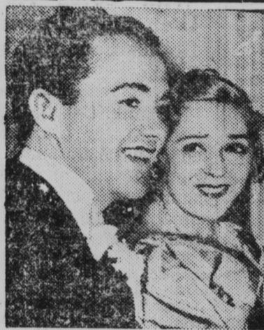
Buddy Rogers and Mary Pickford, popular screen players, announce engagement.