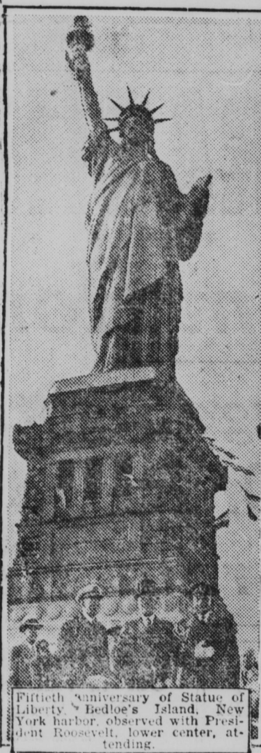
Fiftieth anniversary of Statue of Liberty... observed with President Roosevelt, lower center, attending.