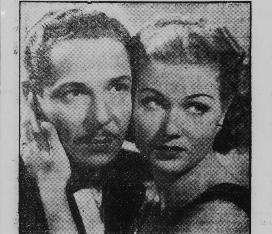
Roger Pryor and Grace Bradley in "Setting on the Moon" at the Stevenson Sunday Matinee and Night