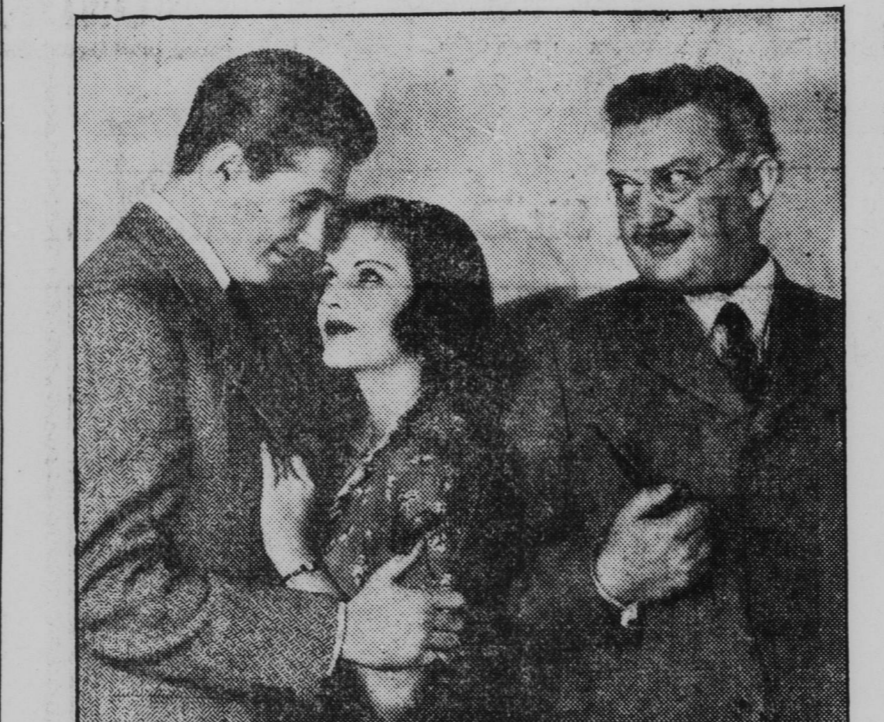
Having prescribed romance for his two favorite patients, Country Doc (for JEAN HERSHOLT) watches ROCHELLE HUDSON and ROBERT KENT to see that they take their medicine. The scene is from the Dionne Quintuplets picture for Twentieth Century-Fox, "Reunion."