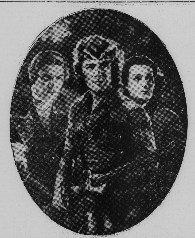
Scene from "Last of the Mohicans" at the Vance Sunday Night at 8:30 and Mon., Tues., Wed.