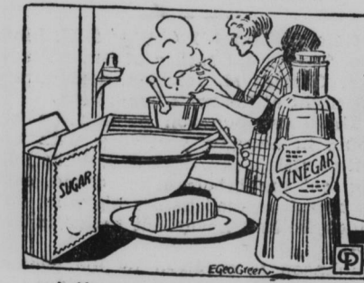
A tiny amount of vinegar added to your home-made candy ingredients will prevent the candy from becoming grainy.