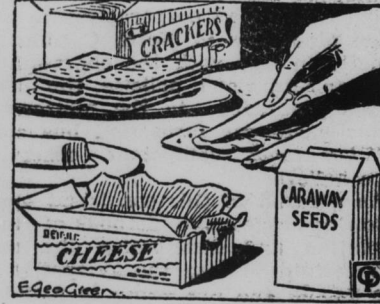
When you are serving soft cheeses with crackers, try using caraway seeds to give a piquant flavor.