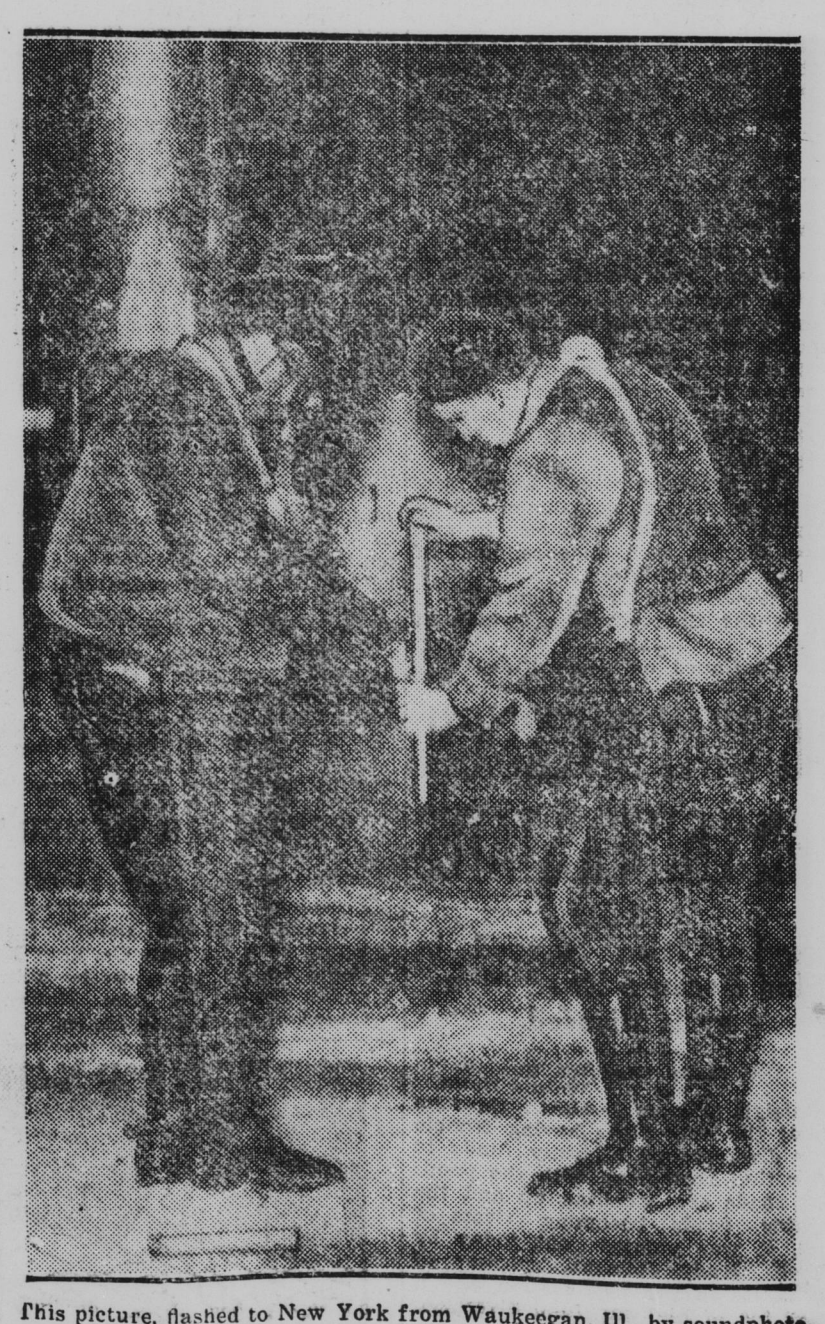
This picture, flashed to New York from Waukeegan, Ill., by soundphote, shows deputy sheriffs reloading their gas guns during the three-hour siege of the Fansteel plant in Waukeegan. Sit-down strikers who had possession of the factory were finally forced out by the fumes, and many, overcome. had to be carried.