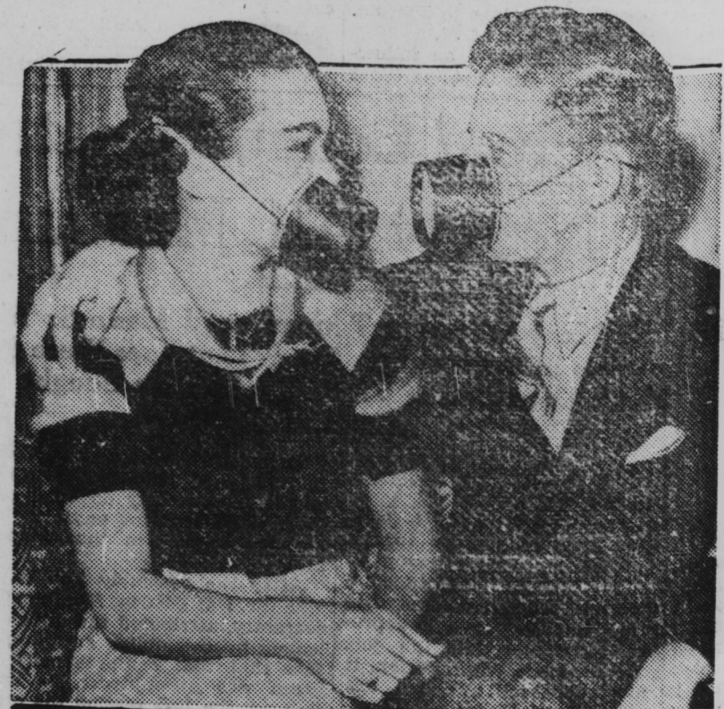
Residents of the great dust bowl are preparing for a recurrence of activity, with reports of dust storms on the way. Here are a pair of lovers in Oklahoma City, Okla., courting under a decided handicap.