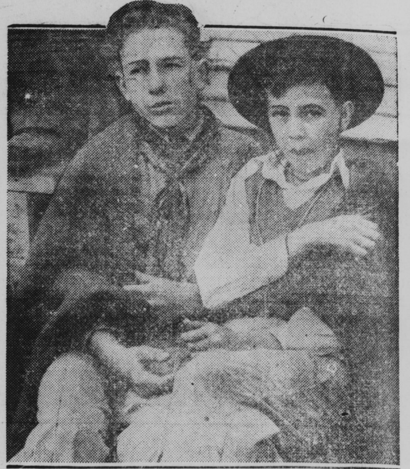
Two lads, one a Boy Scout, who were lucky enough to escape when the tragic blast destroyed the Consolidated School at New London, Tex., and snuffed out the lives of more than four hundred children, are shown above. Their faces reflect the horror, which has settled like a pall on the little oil town.