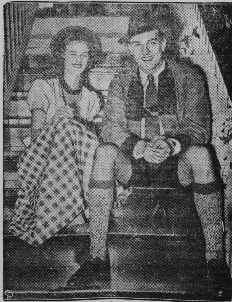
Ethel duPont and Franklin D. Roosevelt, Jr.

The nation's No. 1 sweethearts, Franklin D. Roosevelt, Jr., son of the president, and his fiancée, Ethel duPont, munitions heiress, are seen at a Harvard university costume dance. The two are dressed as Bavarians. Young Roosevelt has fully recovered from his operation for sinus trouble.