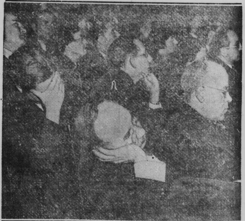
Here's a glimpse of the audience which heard Senator Robert La Follette of Wisconsin, speak in support of President Roosevelt's proposed Federal Court changes. Hand clasped to head, one listens closely as his neighbor dozes away the time.