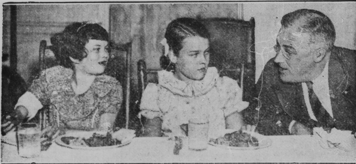
Here's a close-up of the buffet luncheon which was tendered President Roosevelt by patients at the Warm Springs, Ga., Foundation. The President is shown in animated conversation with one of the invalids.