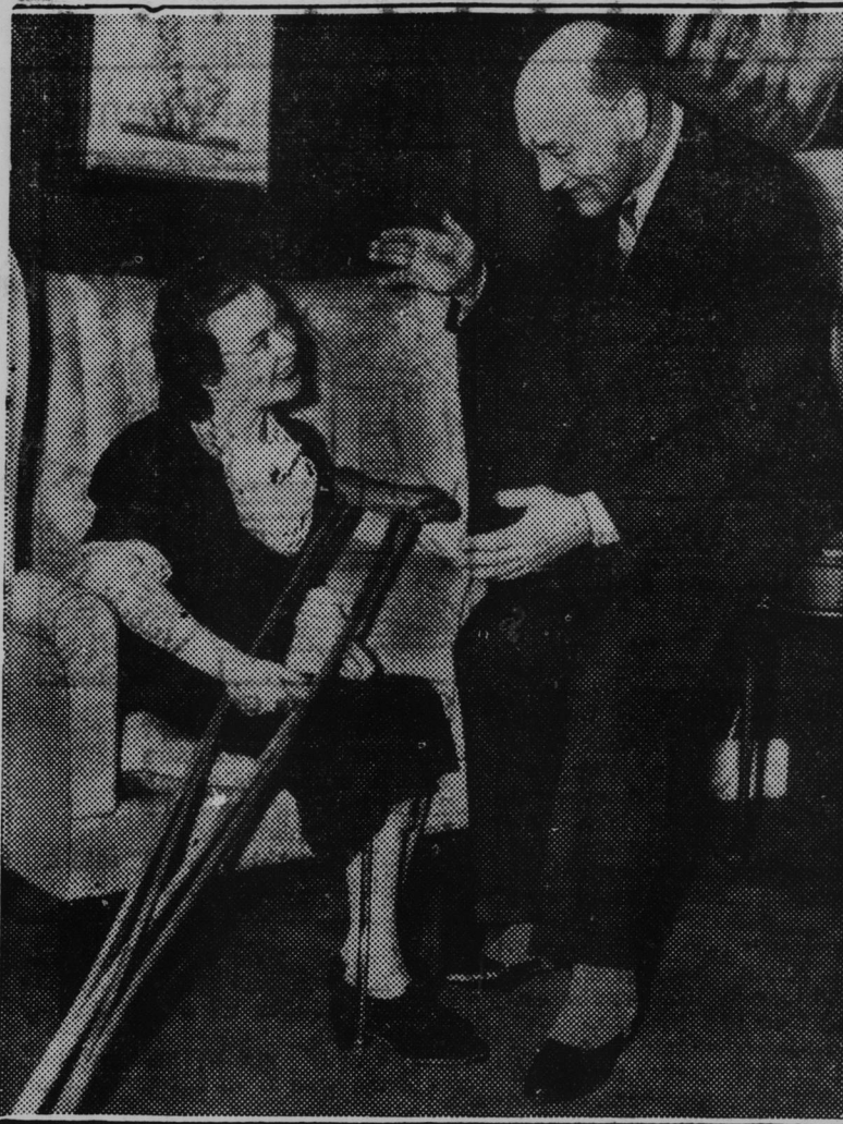
Dr. Roy Chapman Andrews, noted for his Mongolian explorations, and Mrs. Osa Johnson, well-known big-game huntress, swap tall stories at their meeting in New York where Mrs. Johnson is seeking special treatment for her injured leg. Her husband Martin Johnson, lost his life in the West Coast plane crash in which she was injured.