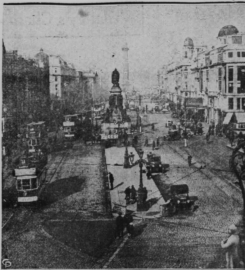
O'Connell street, main thoroughfare of Dublin, capital of the Irish Free State