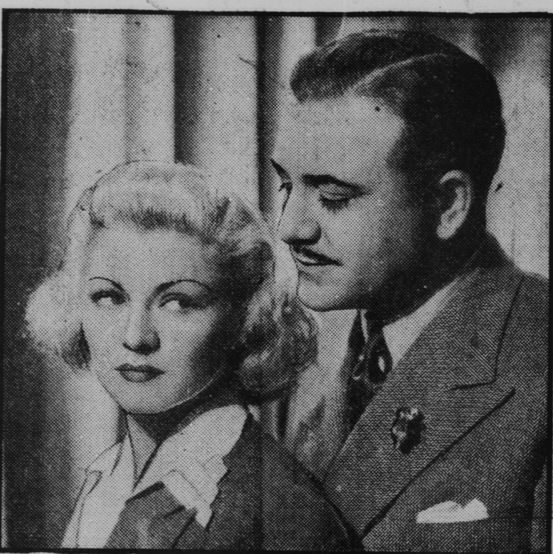
"King of Gamblers" with Claire Trevor—State today, tomorrow