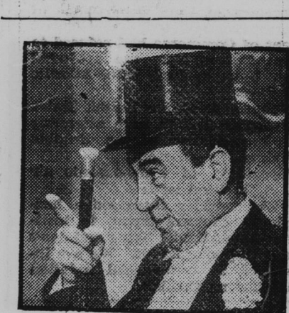
Hugh Herbert-in "That Man's Here Again"

NATIONAL LEAGUE Chicago at Cincinnati. Only games scheduled.