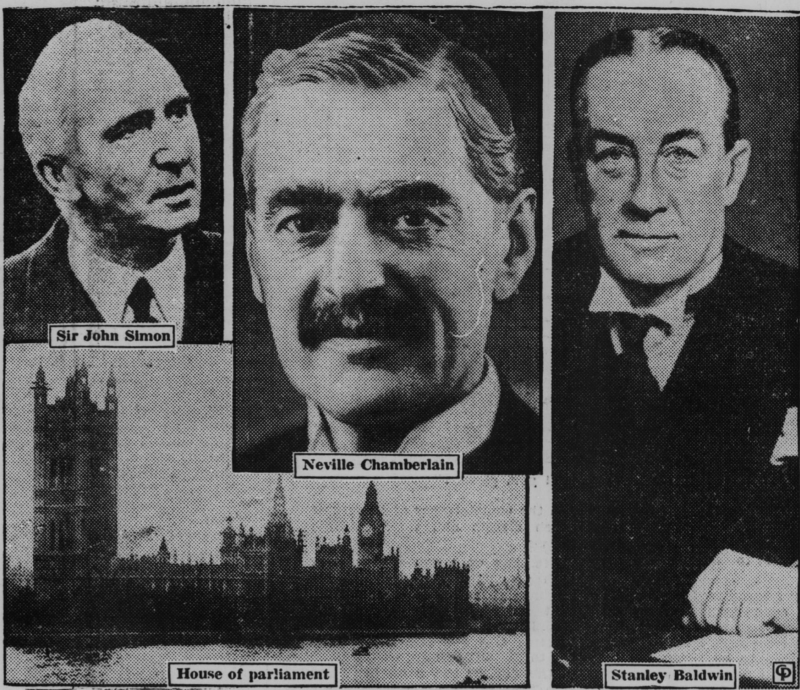
Stanley Baldwin is scheduled to resign as British prime minister on Friday, May 28, four days after entertaining the new king and queen his last function in connection with the coronation. Baldwin will be succeeded by Neville Chamberlain, Conservative leader, now chancellor of the exchequer. Sir John Simon is expected to succeed Chamberlain as chancellor of the exchequer. Baldwin will be given a peerage and will sit in the house of lords in his retirement. He is 70.