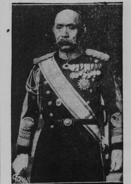
Premier Senjuro Hayashi

Tokyo, May 31 (AP)—The cabinet of General Senjuro Hayashi resigned today under the determined attacks of the major Japanese political parties.