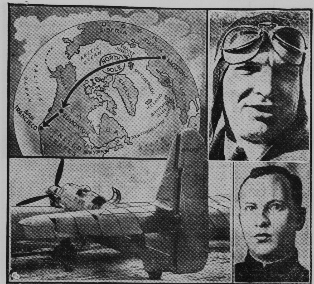
Map of the route followed by the three Russian airmen who hopped off from Moscow on an attempted non-stop hop to San Francisco, a perilous 6,000-mile trip, is pictured above. They were forced down near Seattle some 500 miles short of their goal. The plane is a monoplane, piloted by Valerie Chikalov and Co-Pilot Georgi Baidukov and navigator Alex Beliakov.