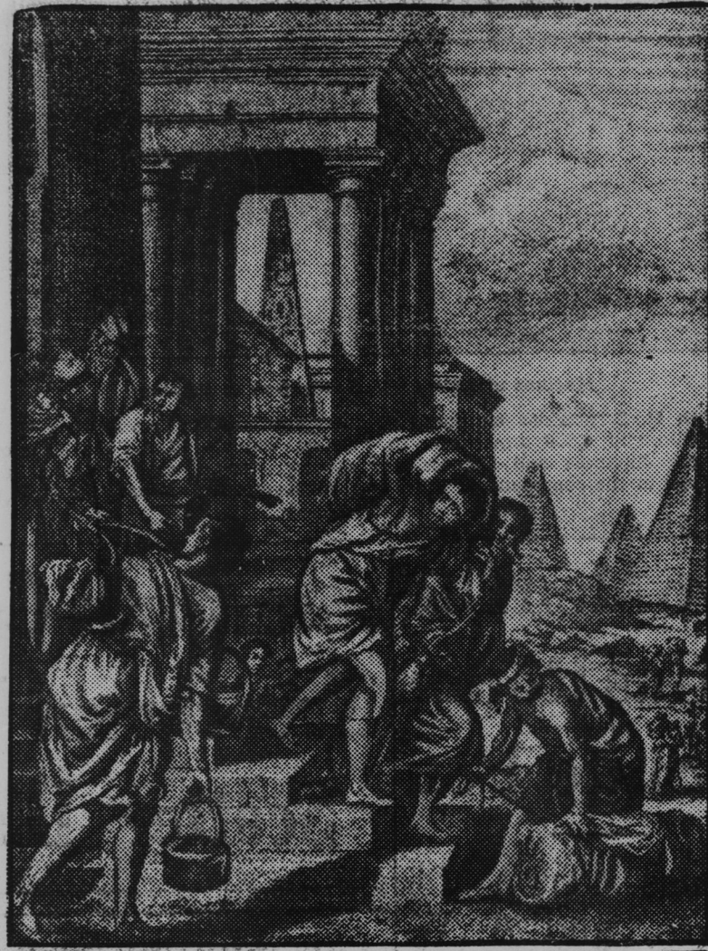
Isaiah 57:11—"The Lord will guide thee continually."

By DR. ALVIN E. BELL (The International Uniform Lesson on the above topic for Aug. 1 is Exodus 13:17-15:21, especially 13:17-22; 14:10-15, the Golden Text being Isaiah 57:11. "The Lord will guide thee continually.")