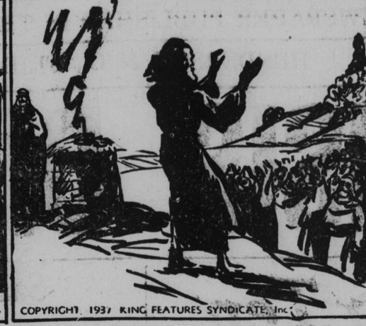
After Israel's departure from Egypt Pharaoh decided to force them to return. He pursued them to the Red sea. Here God opened a path for them.