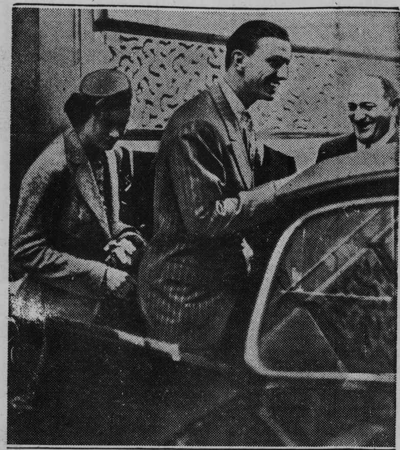
Franklin D. Roosevelt, Jr. and his bride, the former Ethel du Pont, display happy smiles as they enter a taxicab outside their Paris hotel. The couple is making a tour of Europe on their honeymoon.