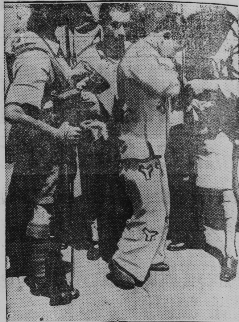
Released prisoner has his uniform removed. These are latest pictures from the Chinese war zone. One shows the body of a traffic policeman in Shanghai, blown 20 feet into the air, hanging over the edge of his traffic tower. He was merely one of hundreds of victims of aerial bombs that fell into the chief shopping center of Shanghai. The other shows a prisoner, one of 7,000 released from the huge Ward road jail, having his uniform removed by members of the Shanghai volunteer corps. The prisoners were released when the prison became a shambles in crossfire.