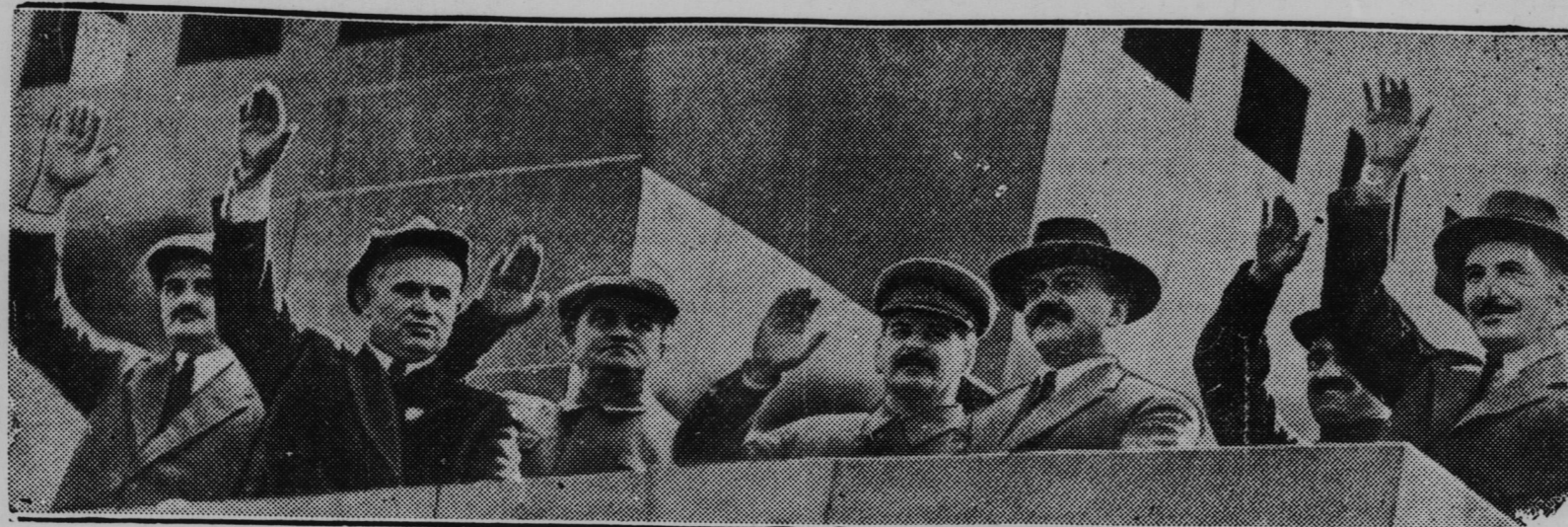
High leaders of the Soviet raise their arms in salute as they watch the demonstration of nearly 1,000,000 youths in Red Square, Moscow, on the 23rd international youth day.