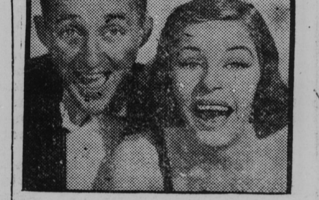
Bing Crosby, Martha Raye—in "Double or Nothing"—Stevenson Starting Sunday.

Denver, Col., Oct. 15.—(AP)—Leaders of the American Federation of Labor scattered to their homes today,