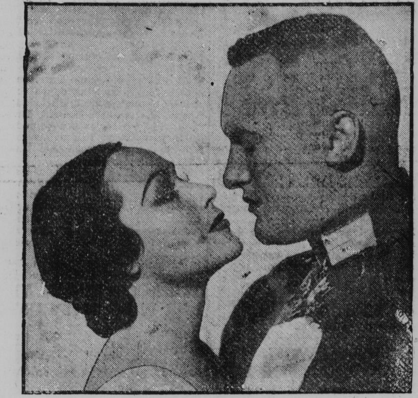
Dolores Del Rio, George Sanders—in "Lancer Spy" Stevenson—Saturday Only