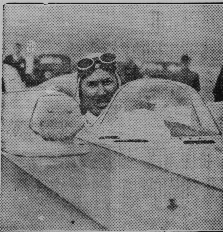
A striking picture of Capt. George E. T. Eyston in the cockpit of his racing car Thunderbolt. He travelled the fastest mile ever made by man on the Bonneville Salt Flats, Utah, at the rate of 310.685 miles an hour, but because of mechanical difficulties failed to break the official world's record set by Sir Malcolm Campbell in 1935—391.1292 miles an hour.