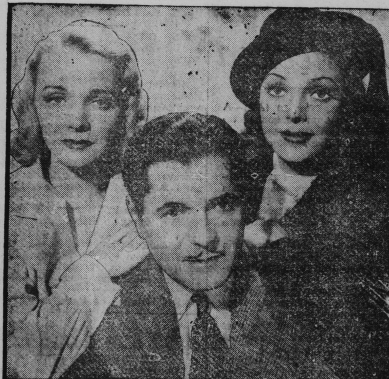
Loretta Young, Warner Baxter and Virginia Bruce—in "Wife, Doctor and Nurse"—Stevenson Thursday and Friday.