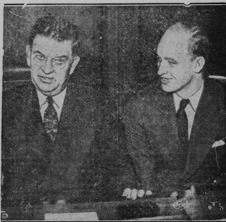
Mayor Edward J. Kelly and James Roosevelt

James Roosevelt, eldest son and secretary of President Roosevelt, visits with Mayor Edward J. Kelly, who heads the Democratic machine in Chicago, and politicians wonder what they discussed. James came to Chicago to address Catholic youth.