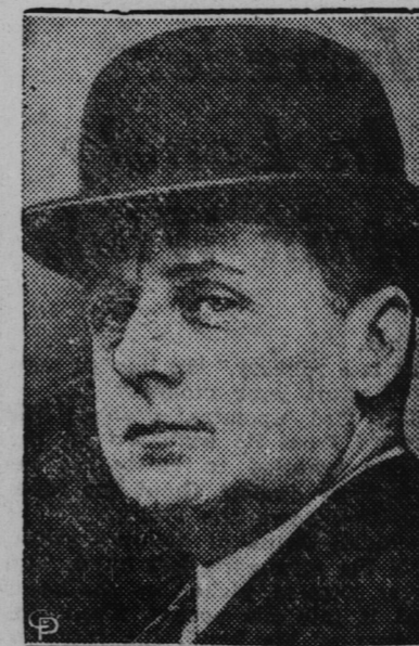
Joachim von Ribbentrop

As Fuehrer Adolf Hitler dramatically offered Germany's services as mediator of the Sino-Japanese war, he sent his ambassador to Britain, Joachim von Ribbentrop, above, to Rome for conclusion of an Italo-German-Japanese "anti-Communist" pact.