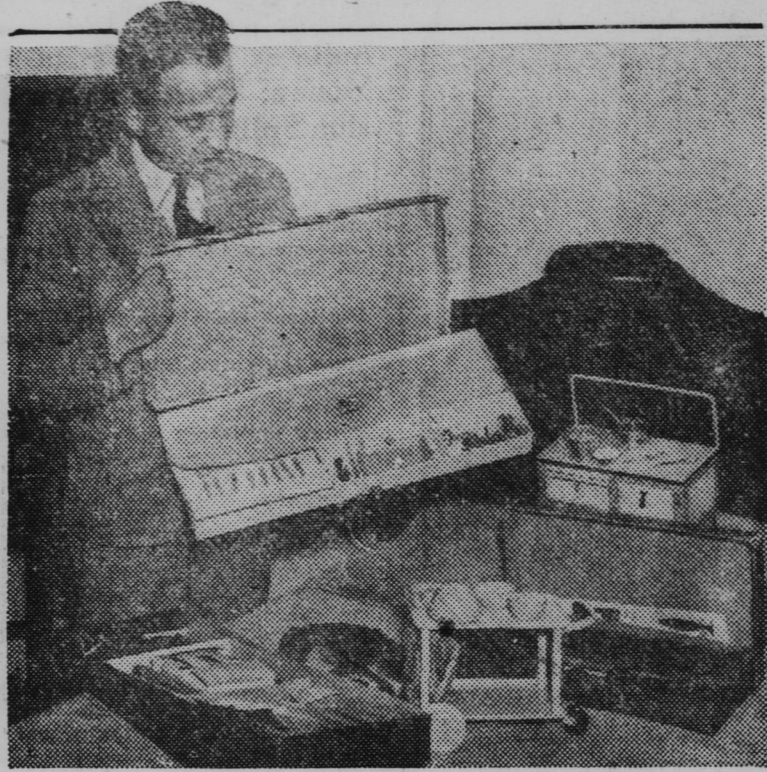
Oliva Dionne, father of the famous quintuplets, is setting an example for New York's shoppers by making Christmas purchases early. Here he is shown in his New York hotel room with gifts for the Dionne quintuplets, and for his six other children.