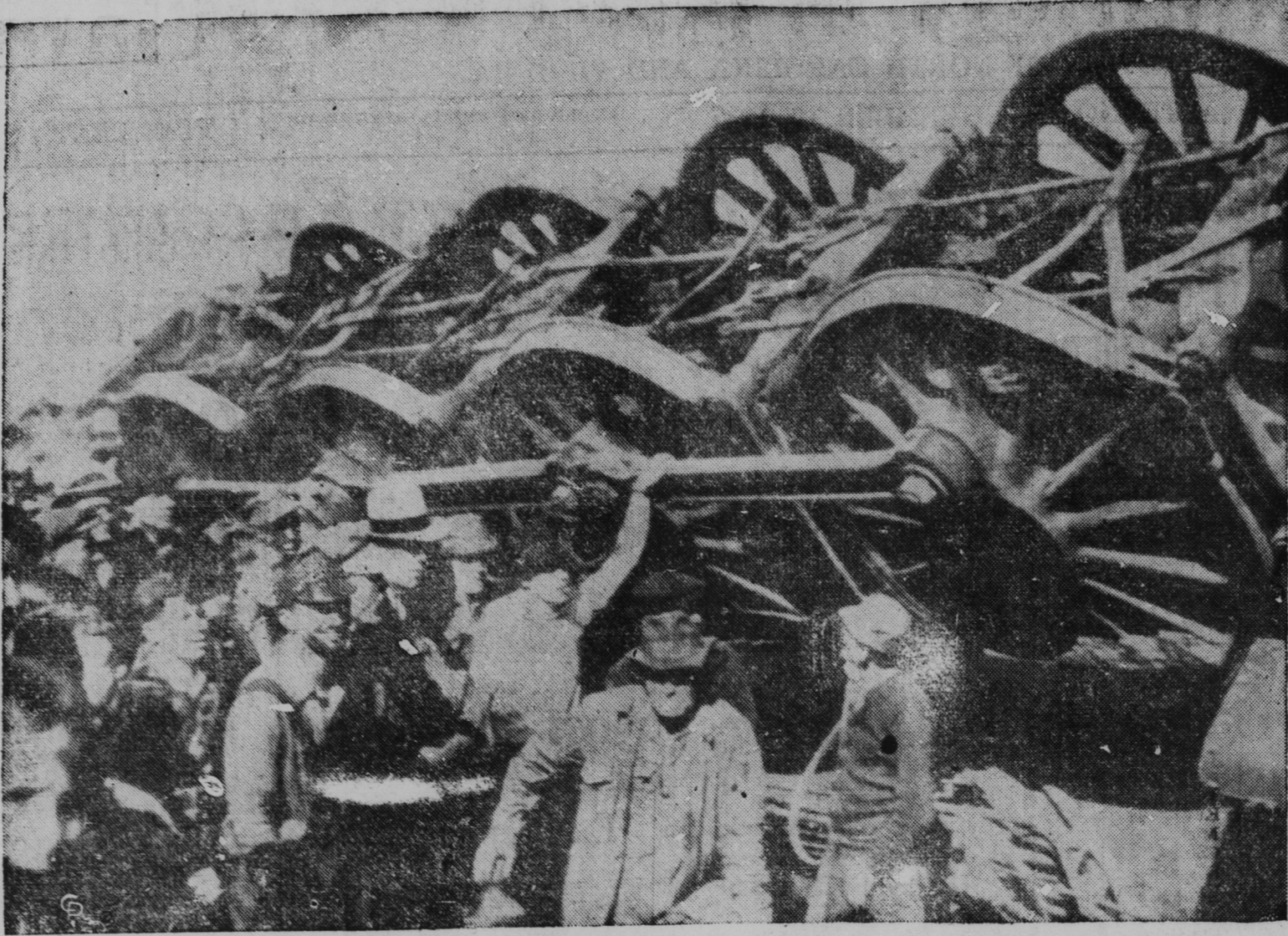
Four persons were killed and several others injured. None critically, when the Southland, luxury passenger train, leaped the rails near Lovejoy, Ga., after crashing into a truck loaded with furniture. Photo shows crowds viewing the overturned locomotive.