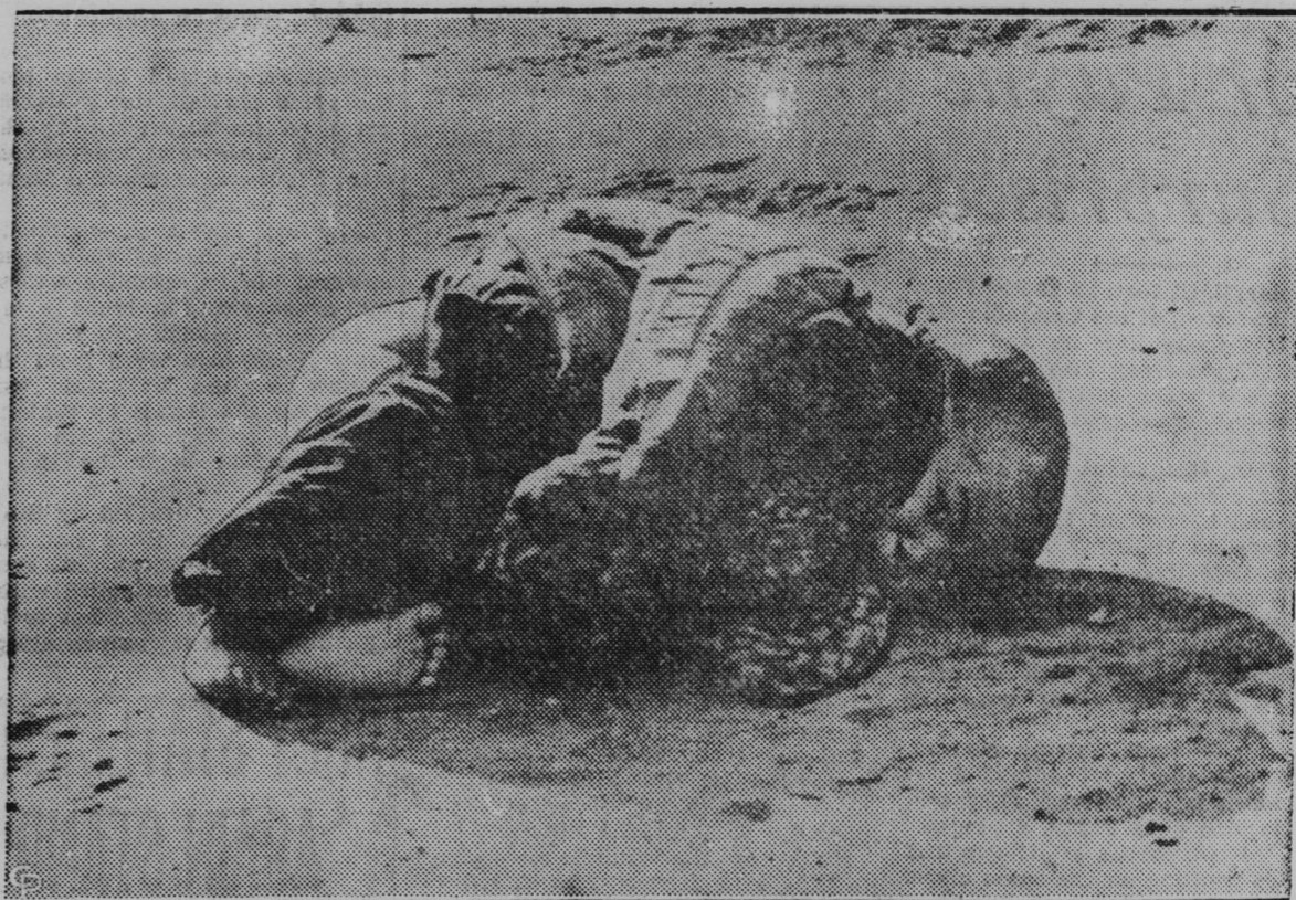
One small voice for peace—an innocent baby, victim of war, his mother dead

Huddled in fright from the noise of booming guns, this little barefoot Chinese baby wails pitifully on the ground in war-torn Shanghai. His mother was felled by Japanese machine gun fire. The baby lay on the street for hours before being picked up by rescuers.