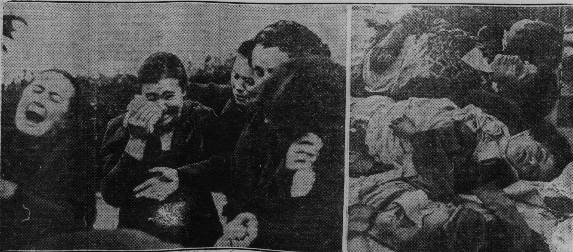
Heartbroken mothers of Lerida, Spain, are pictured at the left, attempting to comfort each other after they had gone through the agonizing ordeal of identifying their children's bodies among the 155 mangled corpses that littered the streets of the city after a bombing raid by Gen. Francisco Franco's airmen on All-Saints Day. Some of the bodies of the more than fifty children taken from a school that was struck by a bomb are shown at the right. Not one child in the building was found alive.