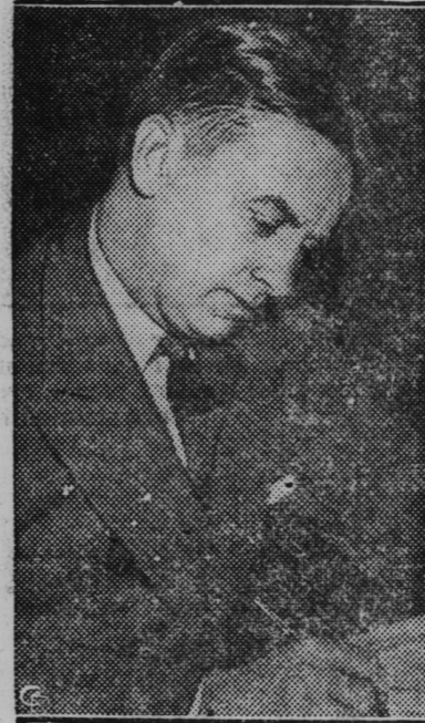
Safety Director Elliot Ness