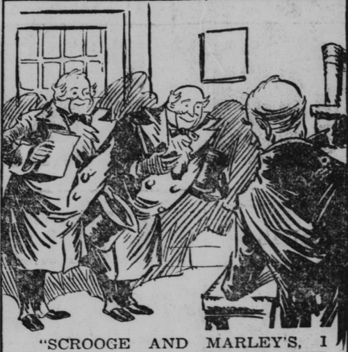
"SCROOGE AND MARLEY'S, I BELIEVE," SAID ONE OF THE GENTLEMEN. "HAVE I THE PLEASURE OF ADDRESSING MR. SCROOGE OR MR. MARLEY?" "MR. MARLEY HAS BEEN DEAD THESE SEVEN YEARS," SAID SCROOGE.