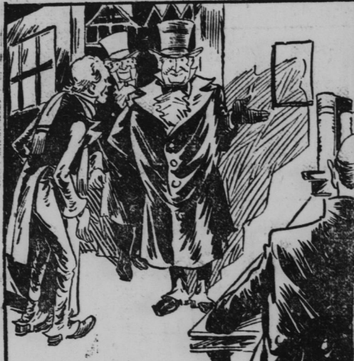
THE CLERK IN LETTING SCROOGE'S NEPHEW OUT HAD LET TWO OTHER PEOPLE IN. THEY WERE PORTLY GENTLEMEN AND PLEASANT TO BEHOLD.