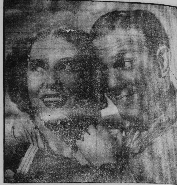
Gracie Allen and Fred Astaire in "Damsel in Distress" Stevenson Sunday, Monday and Tuesday.