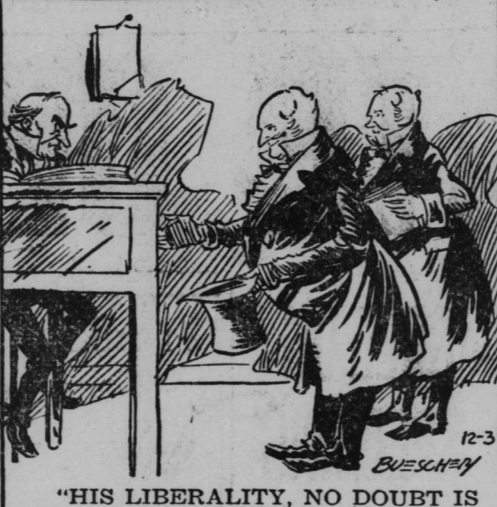
"HIS LIBERILITY, NO DOUBT IS REPRESENTED BY HIS SURVIVING PARTNER, AND AT THIS FESTIVE SEASON OF THE YEAR IT IS DESIRABLE TO MAKE SOME SLIGHT PROVISION FOR THE POOR AND DESTITUTE," SAID ONE.