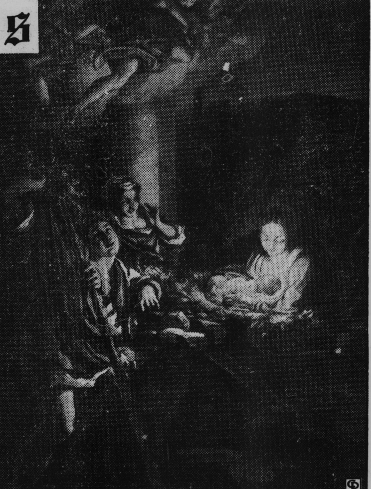
Holy Night by Correggio