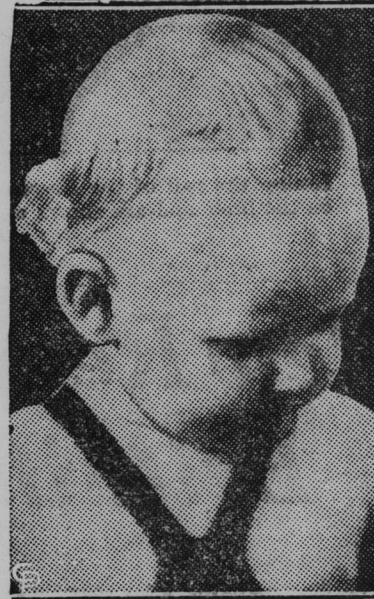
Prince Vittorio Emmanuel ... heir presumptive to throne

A new portrait of the infant Prince Vittorio Emmanuel, Prince of Naples and heir presumptive to the throne of Italy. The boy is the son of Crown Prince Umberto and Crown Princess Maria. He was named after his grandfather, King Victor Emmanuel.