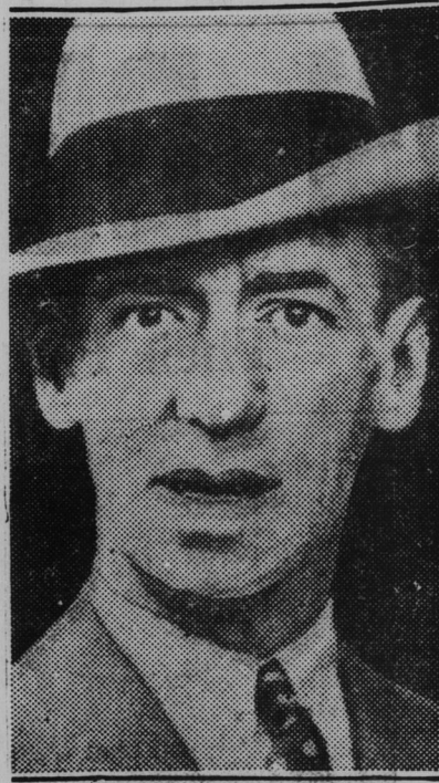
O. O. McIntyre, native of Gallipolis, O., whose New York column was syndicated more widely than any other column in the country, died in his Park Avenue apartment of a heart attack. He was 54 years old.