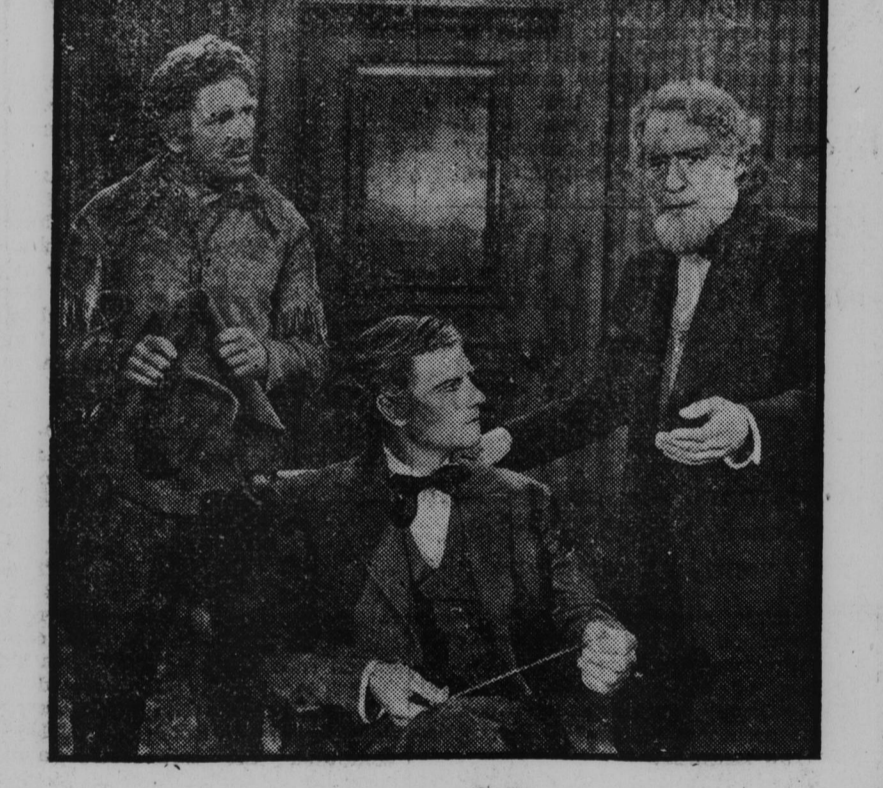
Bob Burns, Joel McCrea and Henry Stephenson in "Wells Fargo" Stevenson Friday and Saturday.