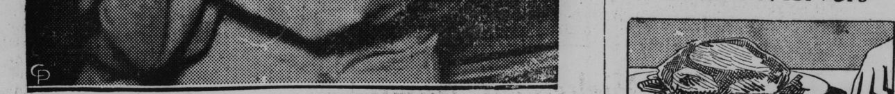
British gas-masked sentry stands guard behind sand bags in London, during demonstration of air raid precautions given at Wellington barracks by members of the Grenadier and Coldstream Guards.